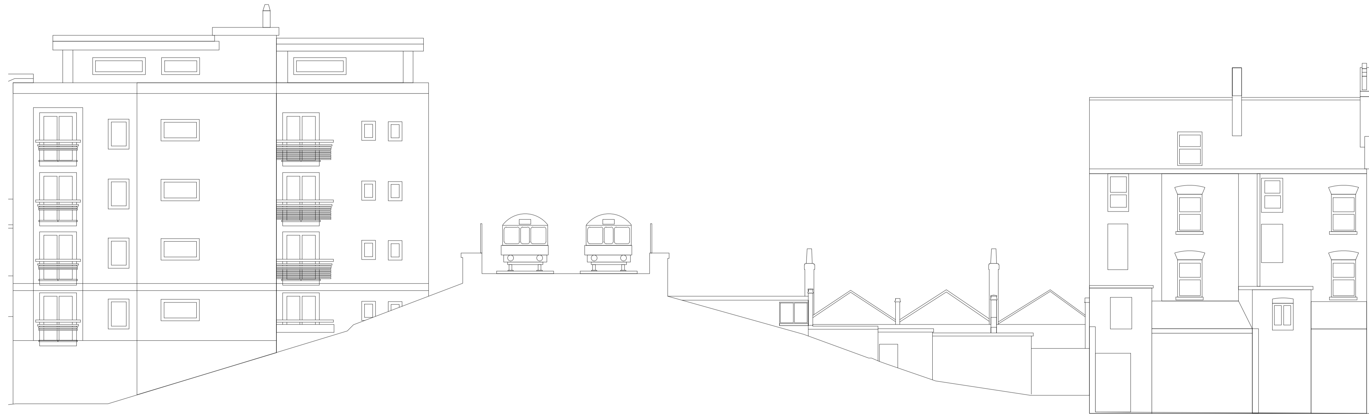
1 FRONT ELEVATION SCALE 1:100