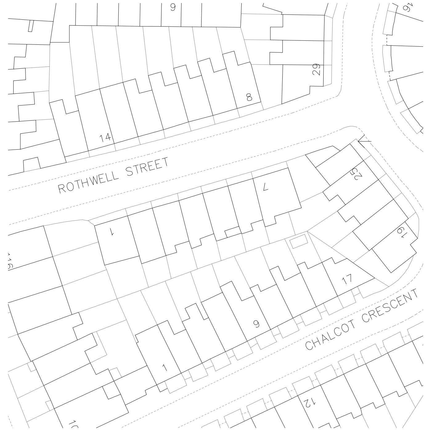
Block Plan (scale 1:500)