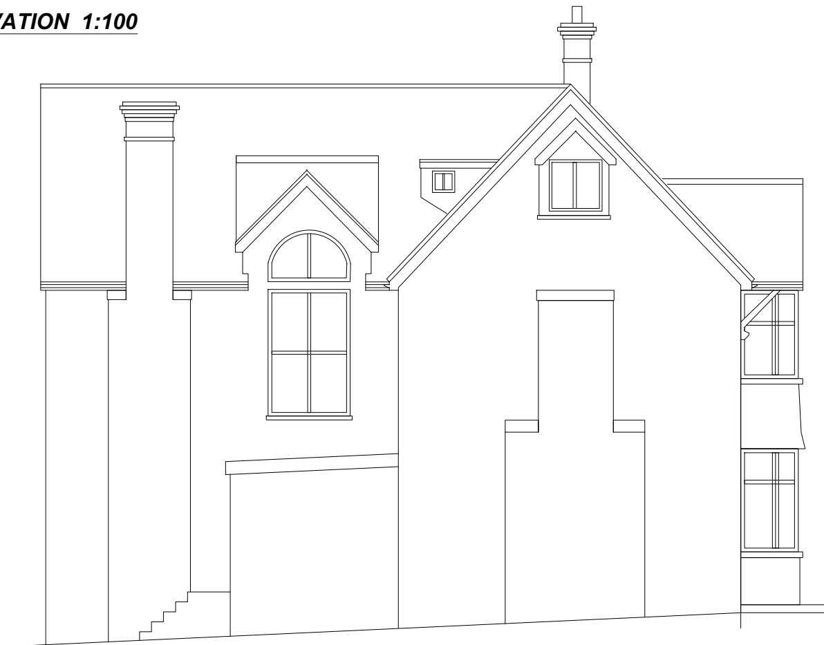
EXISTING SIDE ELEVATION 1:100