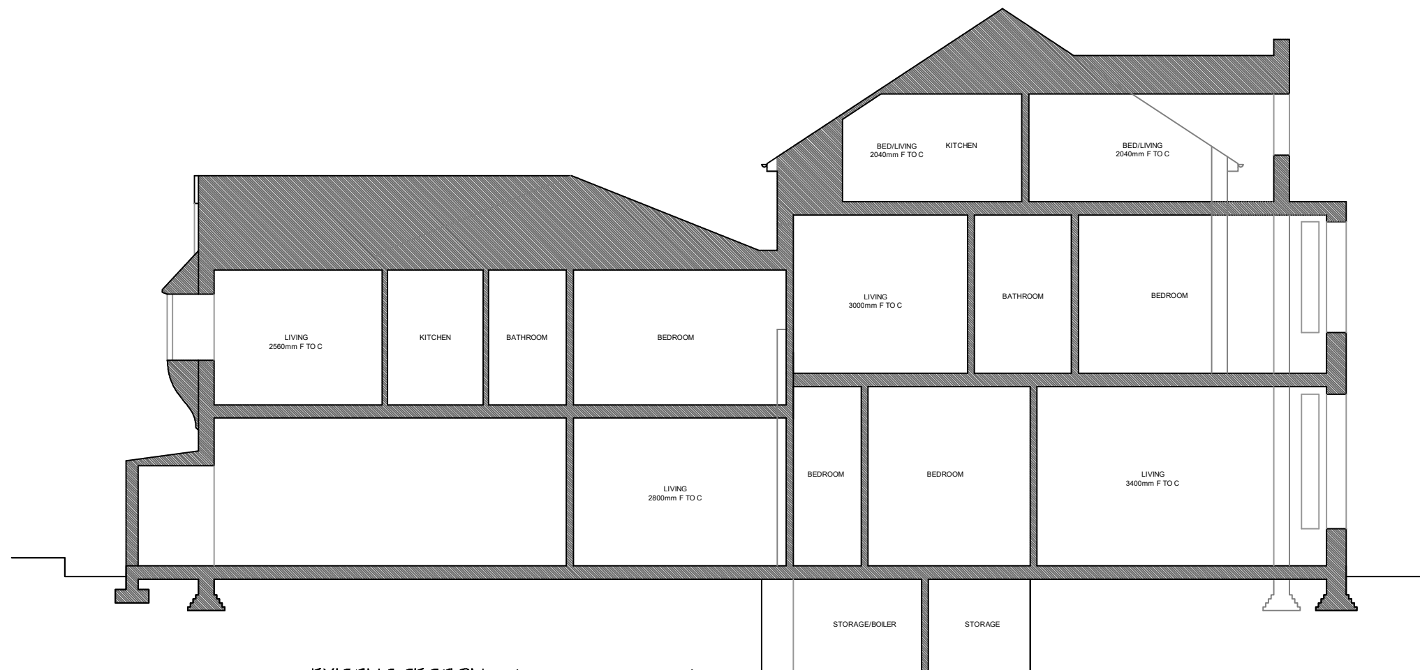
EXISTING SECTION - (Front to Rear)