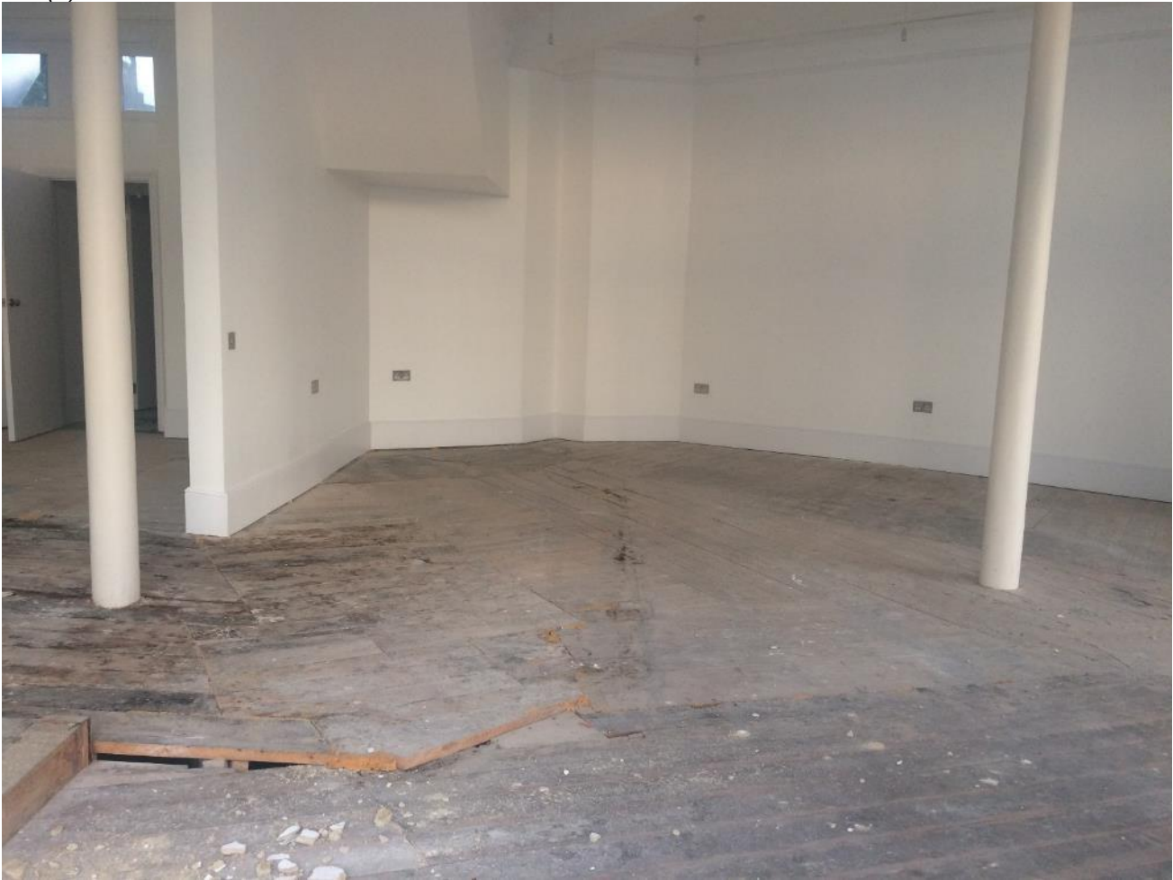
(8) Ground floor unit current condition #3