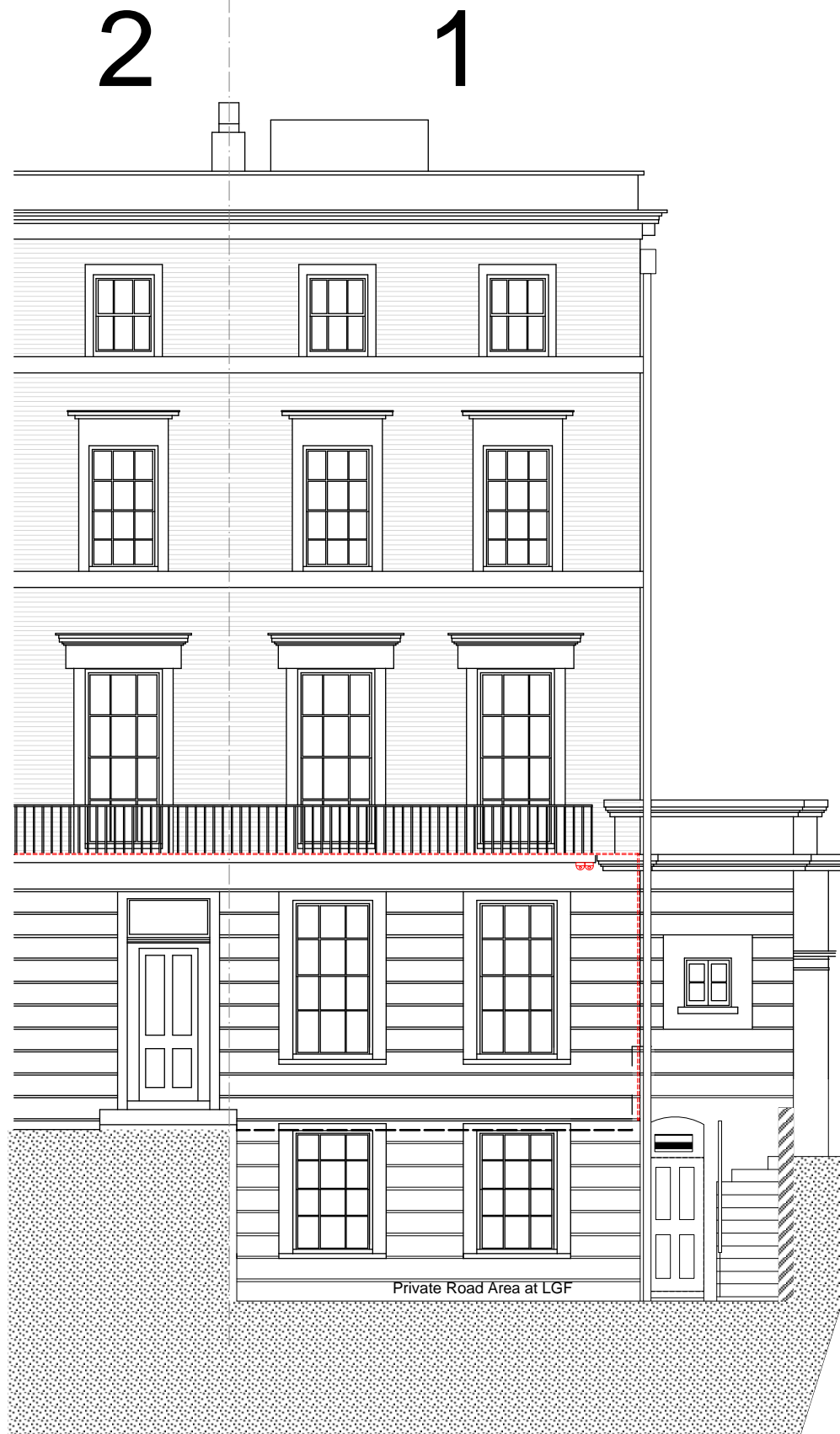
RPT Private Road Elevation