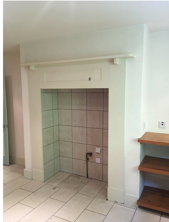
LOWER GROUND FLOOR - REAR