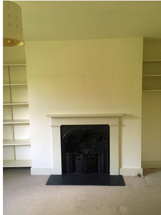
LOWER GROUND FLOOR - FRONT