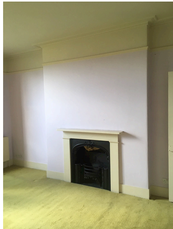
FIRST FLOOR - FRONT (TO BE INCORPORATED INTO FREESTANDING WARDROBE JOINERY) PLEASE REFER TO DRAWING 411/043