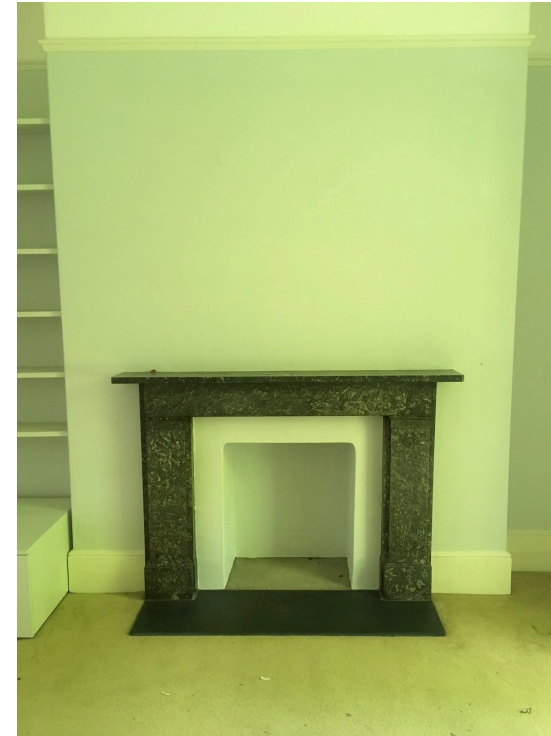
GROUND FLOOR - REAR