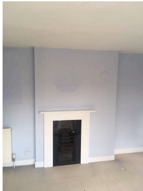
SECOND FLOOR - REAR (TO BE INCORPORATED INTO FREESTANDING JOINERY) PLEASE REFER TO DRAWING 411/043