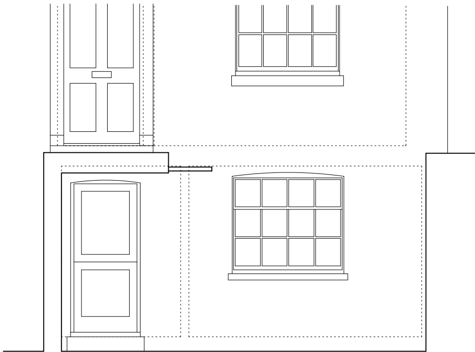
EXISTING FRONT AREA ARRANGEMENT (RAILINGS/BALUSTRADING OMITTED FOR CLARITY)