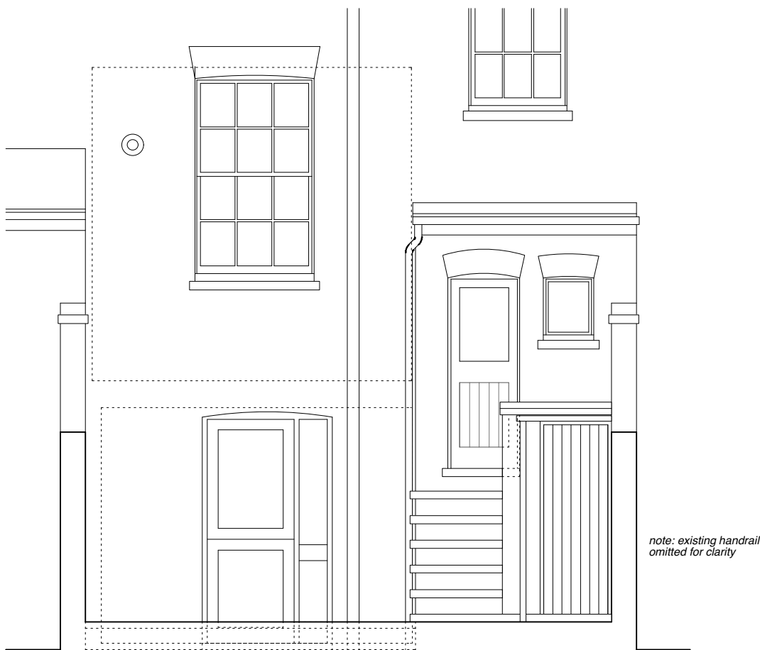
REAR ELEVATION (RAILINGS/BALUSTRADING OMITTED FOR CLARITY)