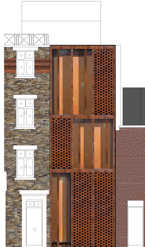
SCREENS PARTIALLY OPEN