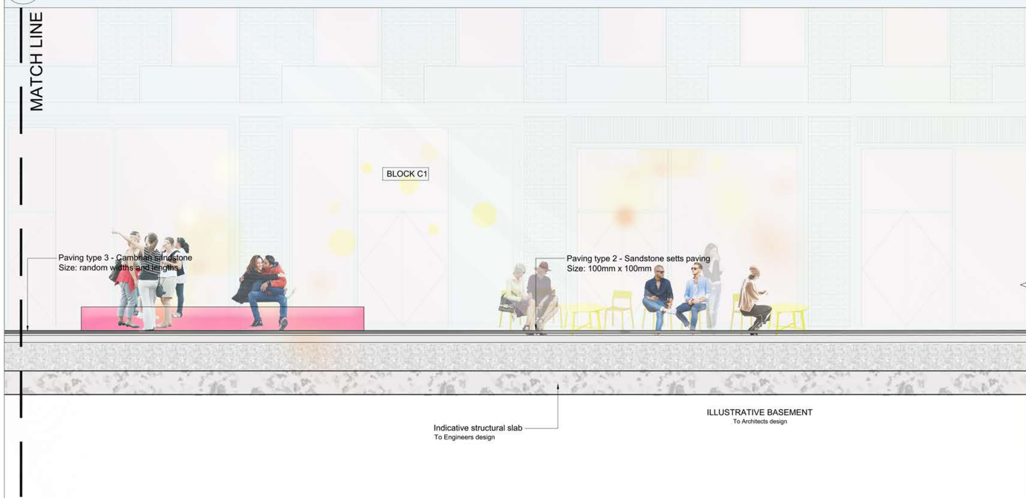
01 L.402 Landscape Section CC Through Plaza and Retail Street SCALE 1:50@A1