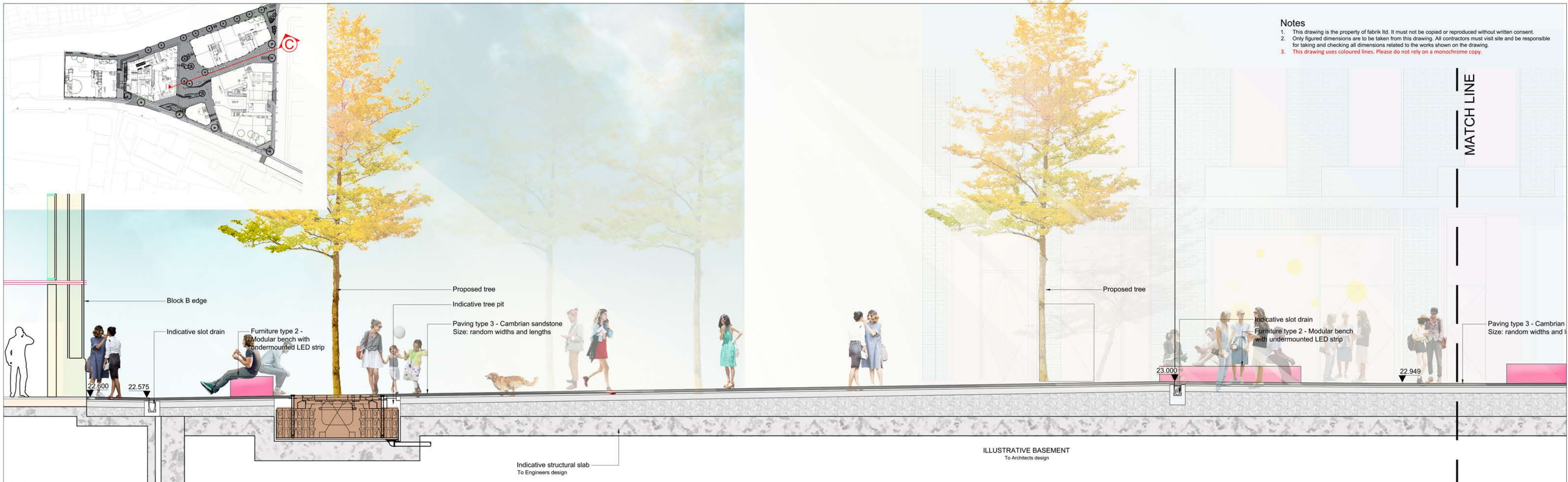
01 L.402 Landscape Section CC Through Plaza and Retail Street SCALE 1:50@A1