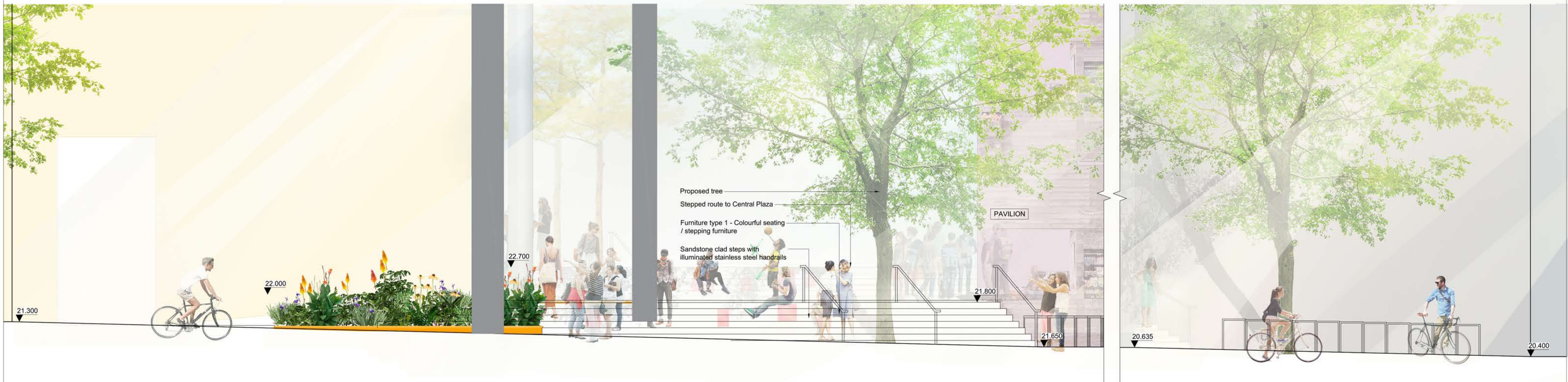
02 Landscape Elevation CC Towards Plaza SCALE 1:50@A1