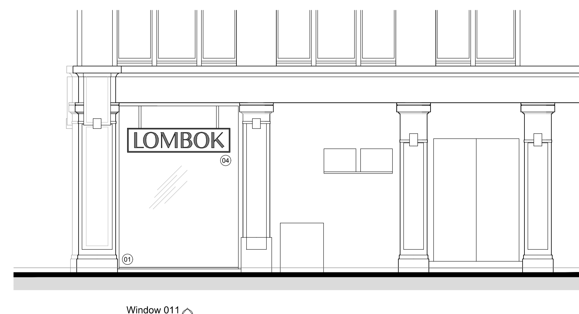
North Crescent Shopfront elevation Scale 1:50

PROJECT: Lombok Tottenham Court Rd TITLE: Proposed Elevations