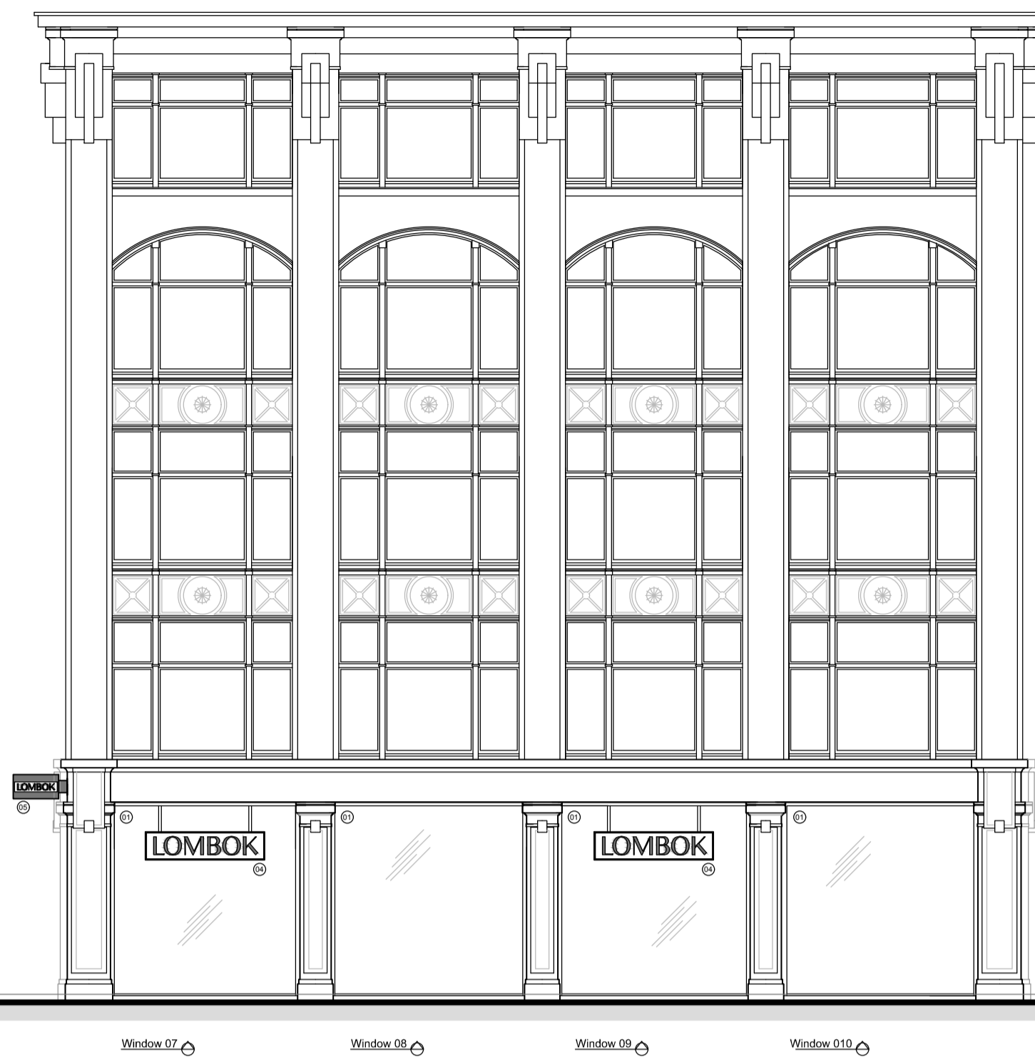
Cheries Street elevation Scale 1:100