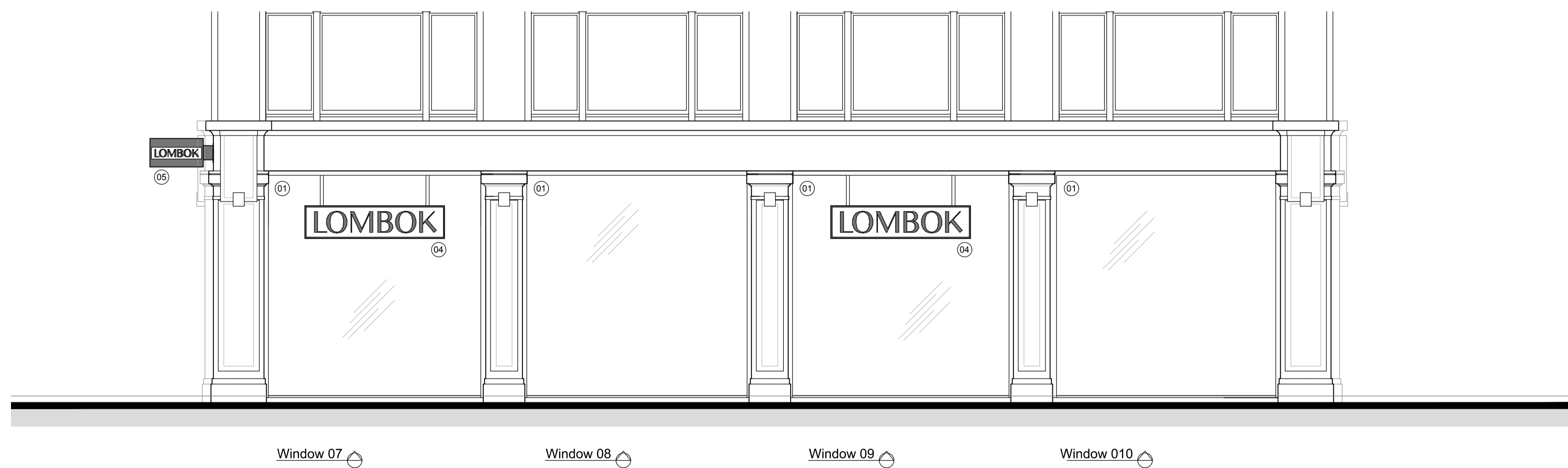
Cheries Street Shopfront elevation Scale 1:50