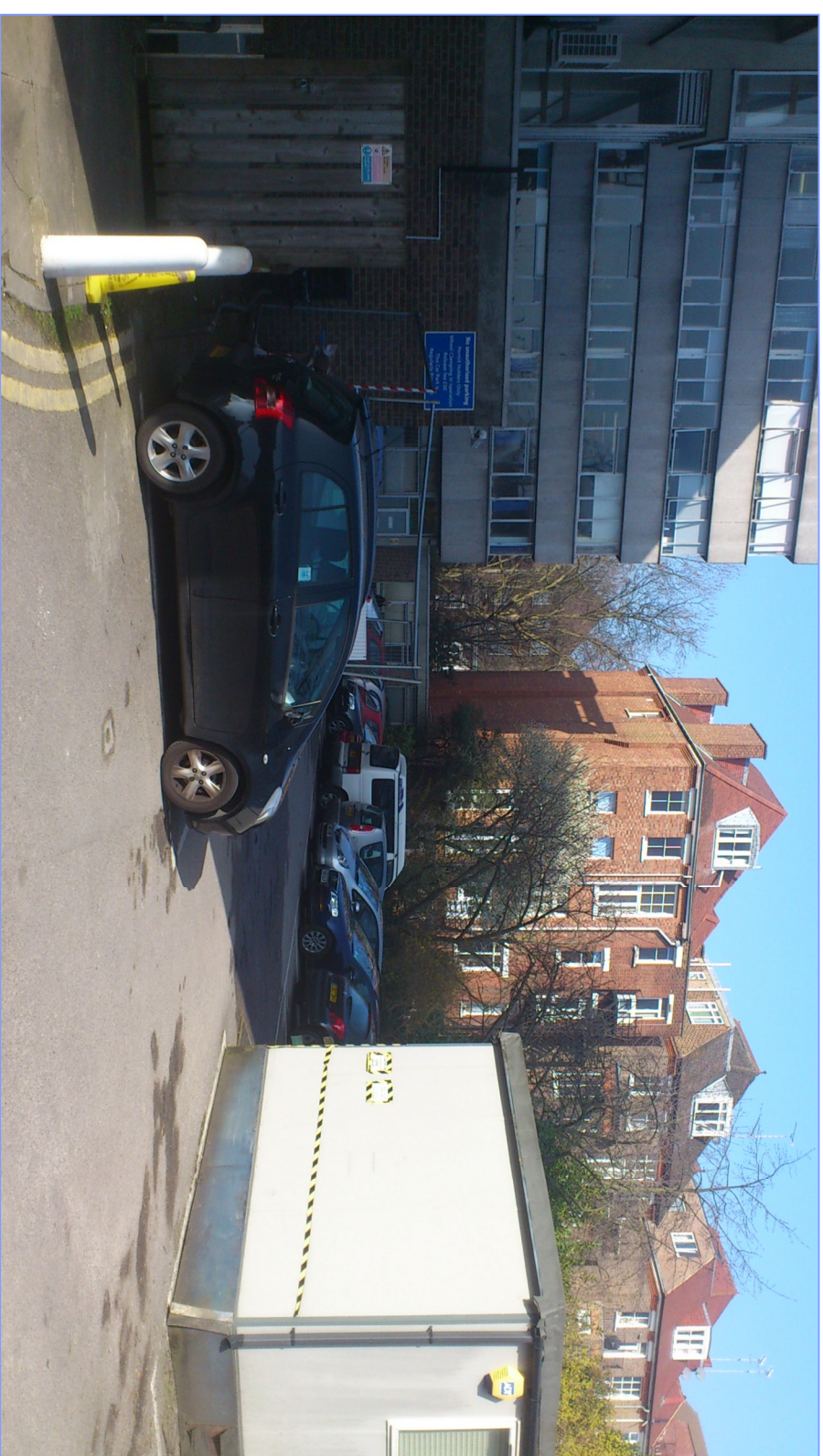
CAR PARK VIEW

TAVISTOCK & PORTMAN NHS FT NEW FNP OFFICES