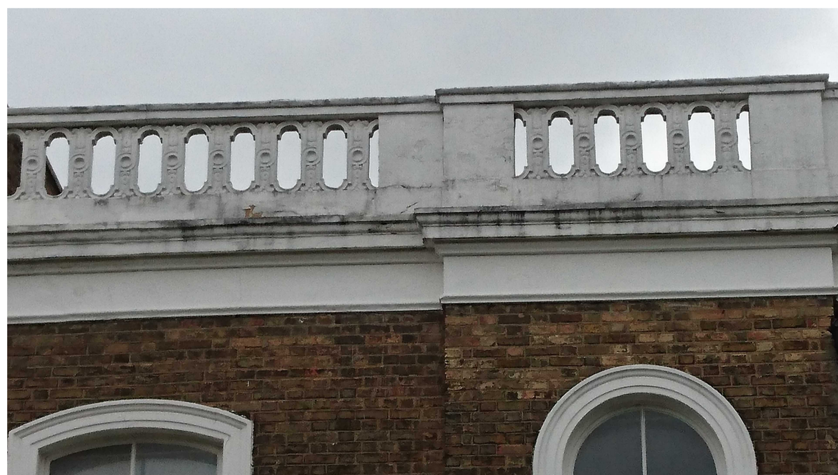
Parapet at No.4 Boscastle Road