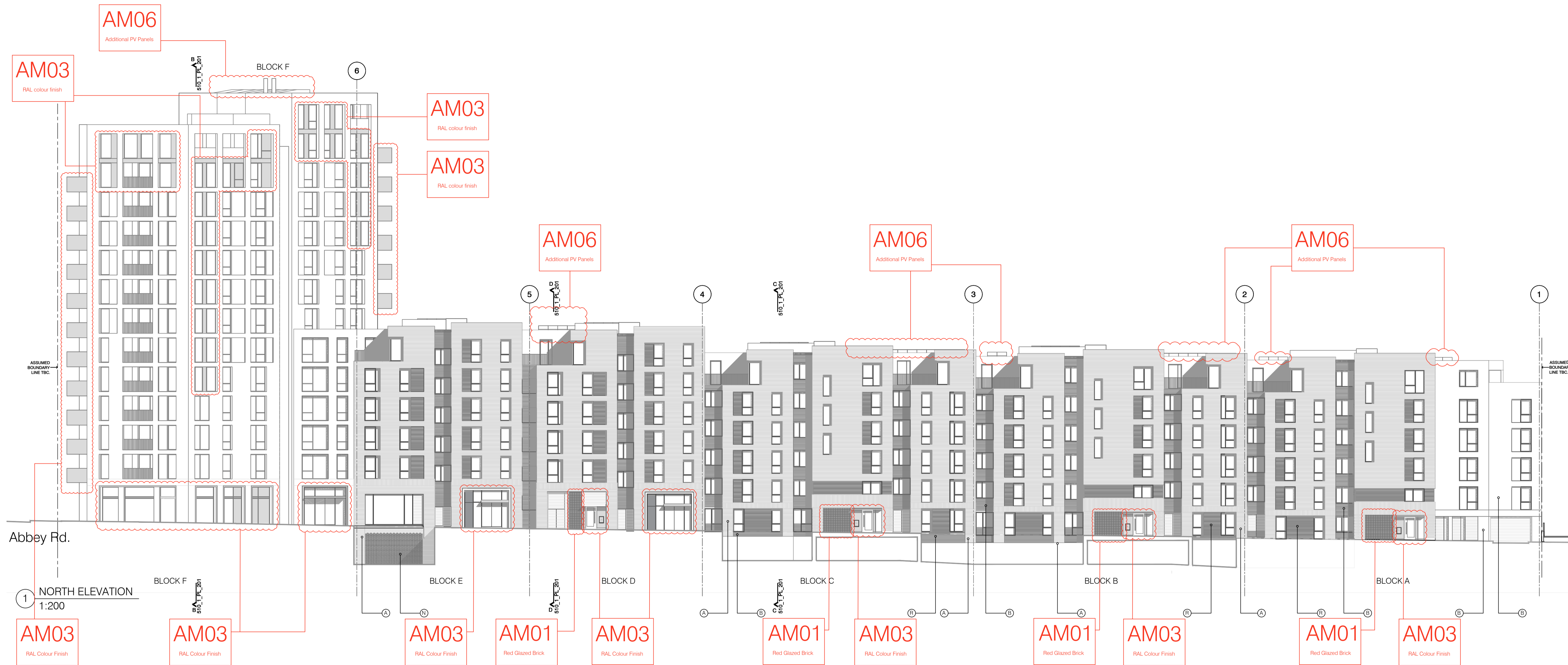
1 NORTH ELEVATION 1:200