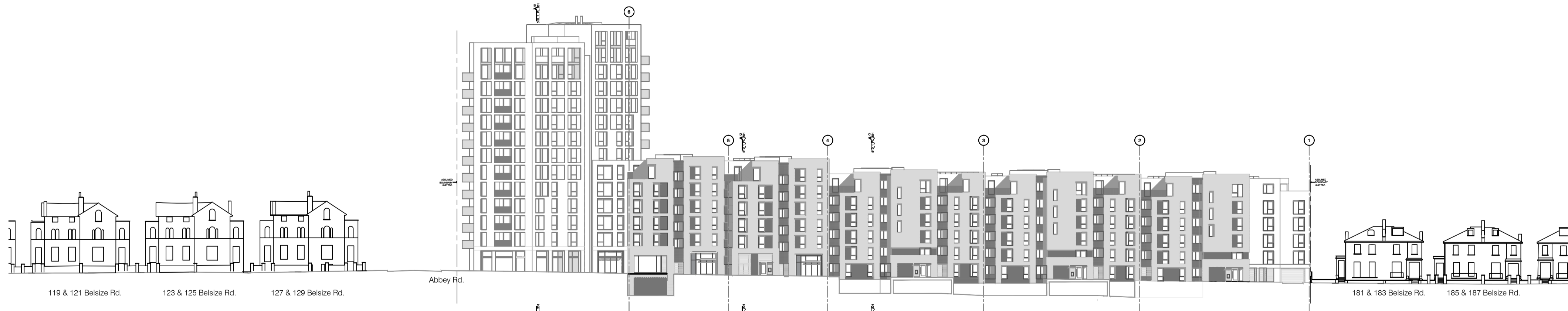
2 NORTH SITE ELEVATION 1:500