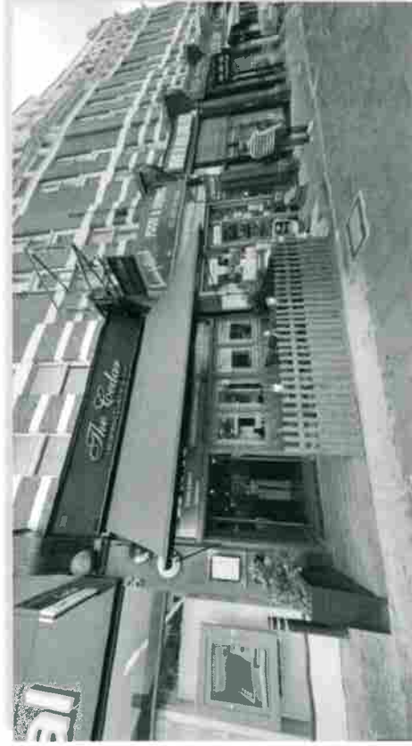
202 West End Lane - Existing timber decking and enclosing balustrade