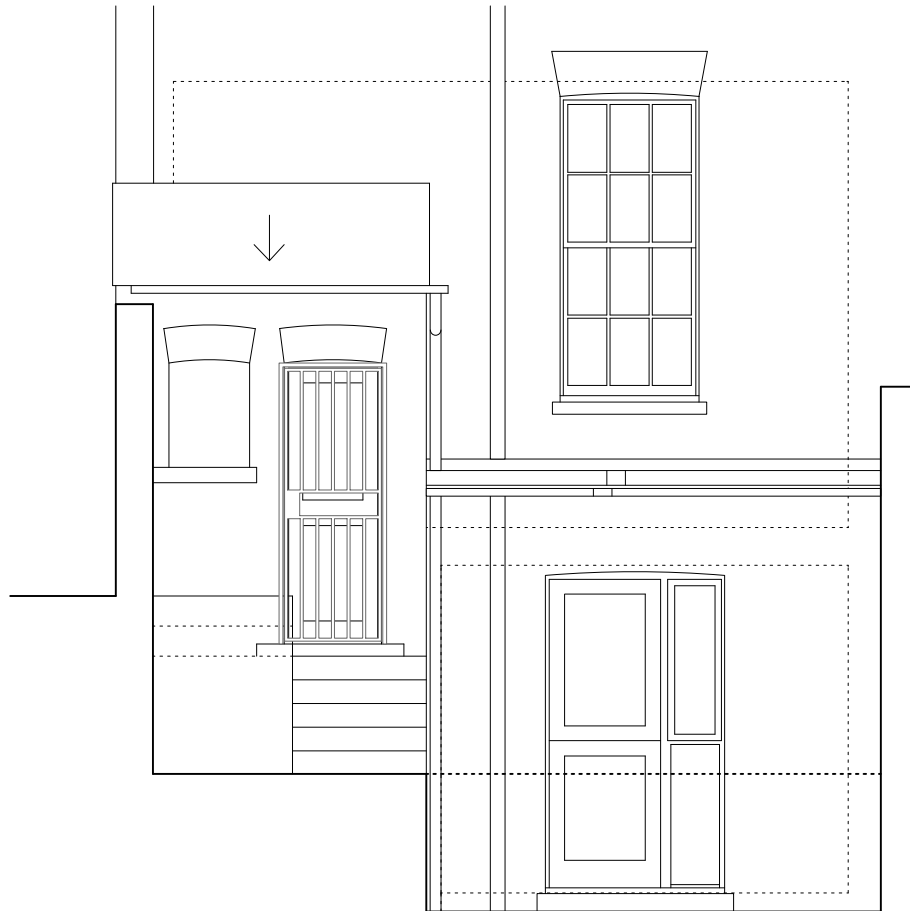
REAR ELEVATION (RAILINGS/BALUSTRATING OMITTED FOR CLARITY)