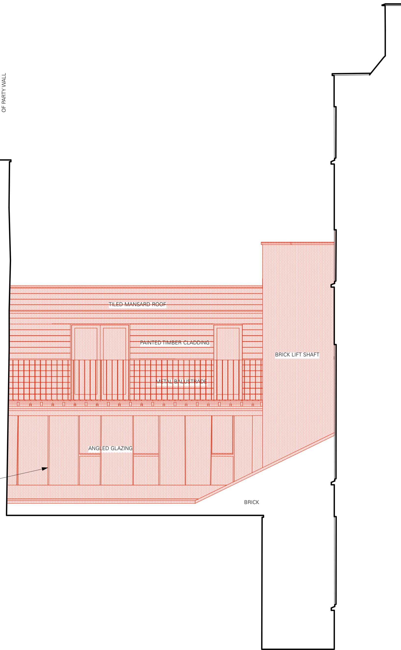
PROPOSED REAR DEMOLITION ELEVATION 1:50 @ A1, 1:100 @ A3

DEMOLISH ANNEXE TO TOP OF EARLY BRICKWORK ALONG PARTY WALL.