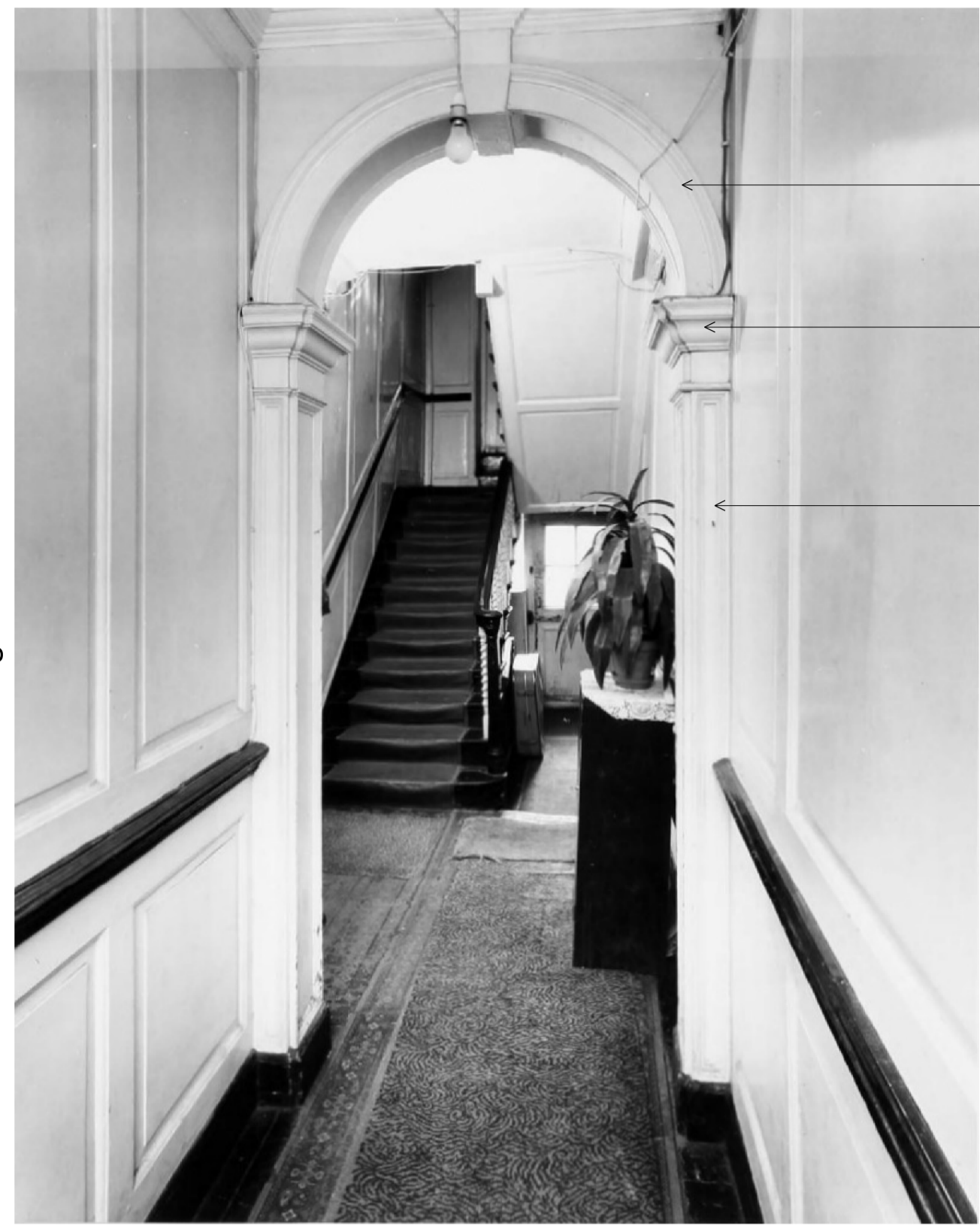
03 X_506 Precedent Archway in Hallway 21 Dombey Street - built c. 1709

New full-height pilasters to be formed in timber with panelling detail to match rest of hallway