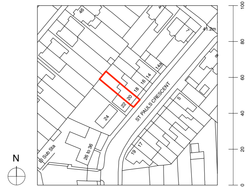
EXISTING LOCATION PLAN SCALE 1:1250@A3