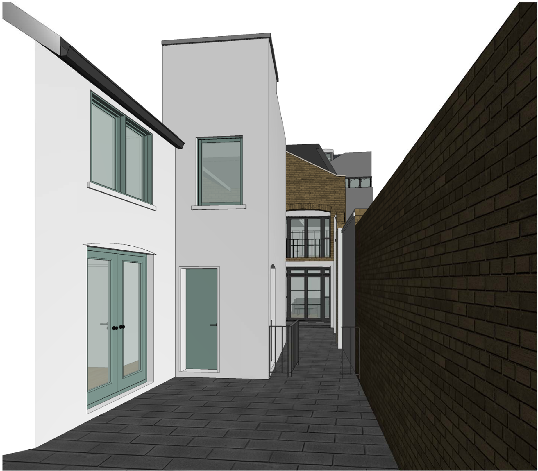
2 Street View