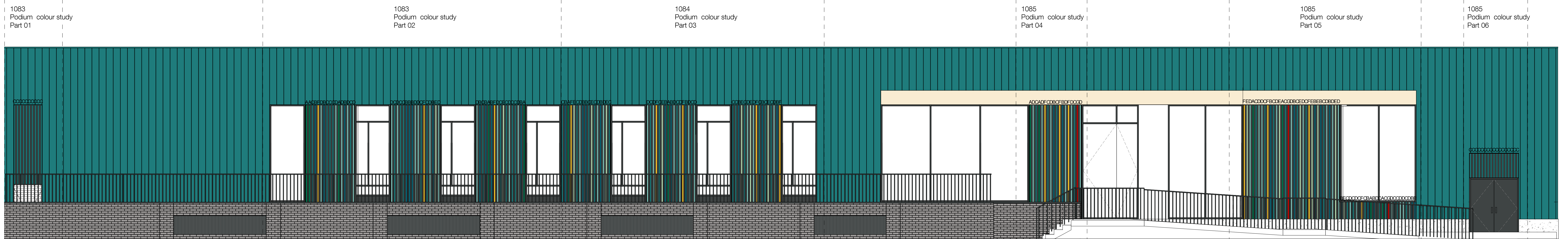
2 187 Podium Colour study_Elevation 1 : 50