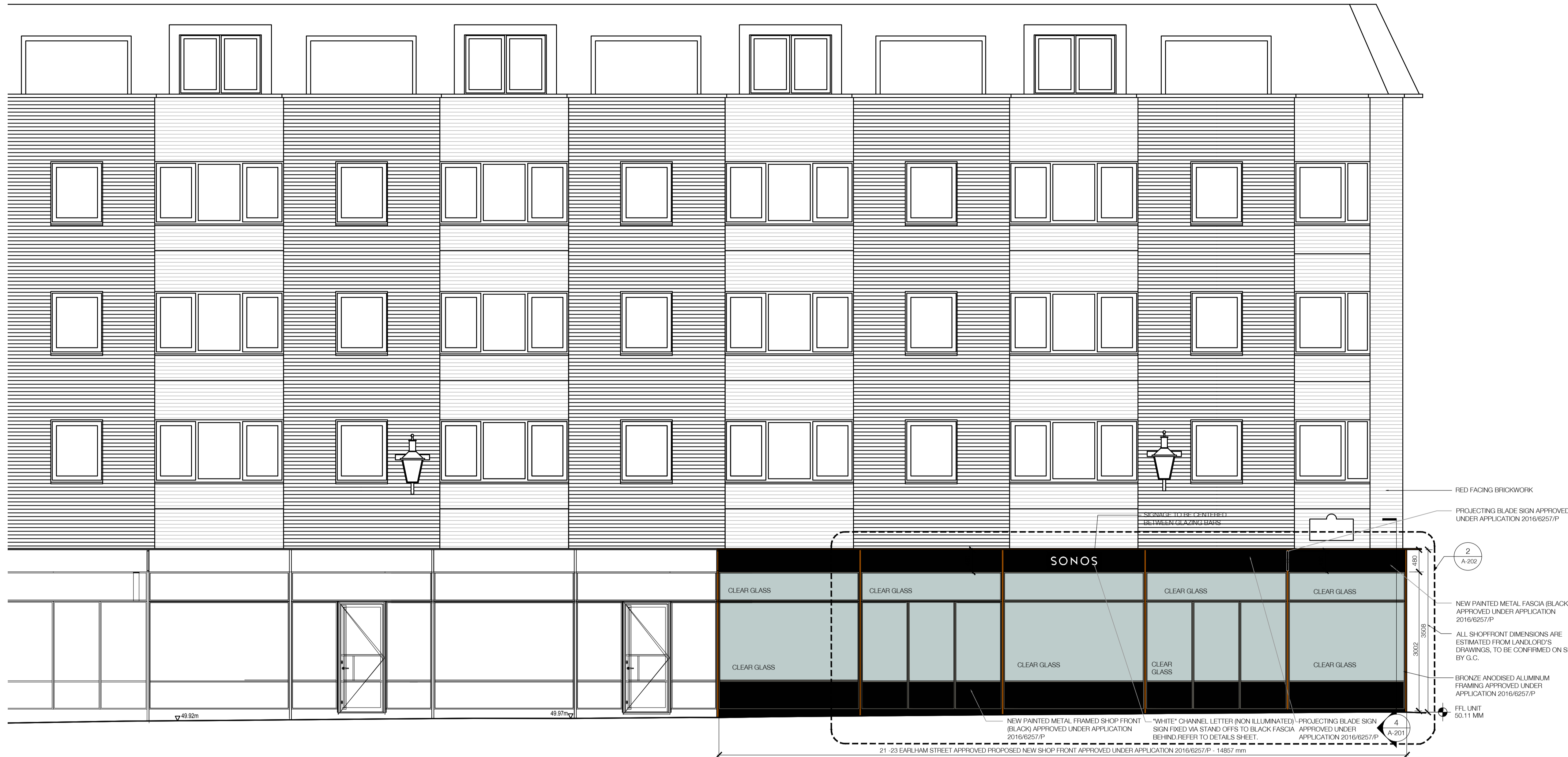
1 PROPOSED SHOP FRONT ELEVATION