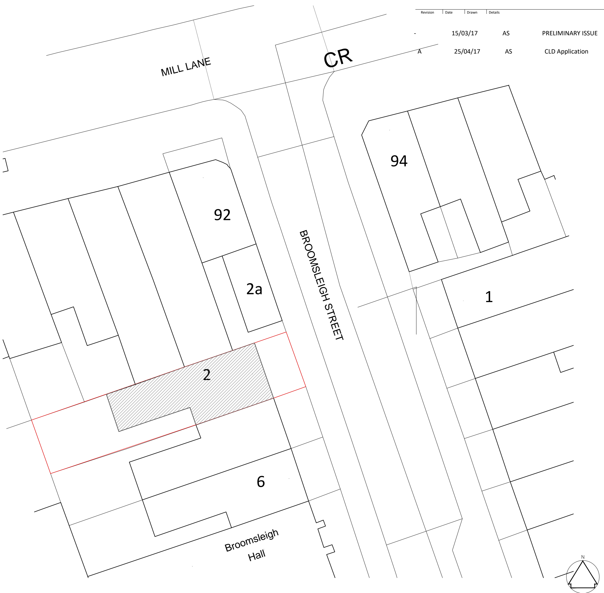
BLOCK PLAN SCALE 1:200