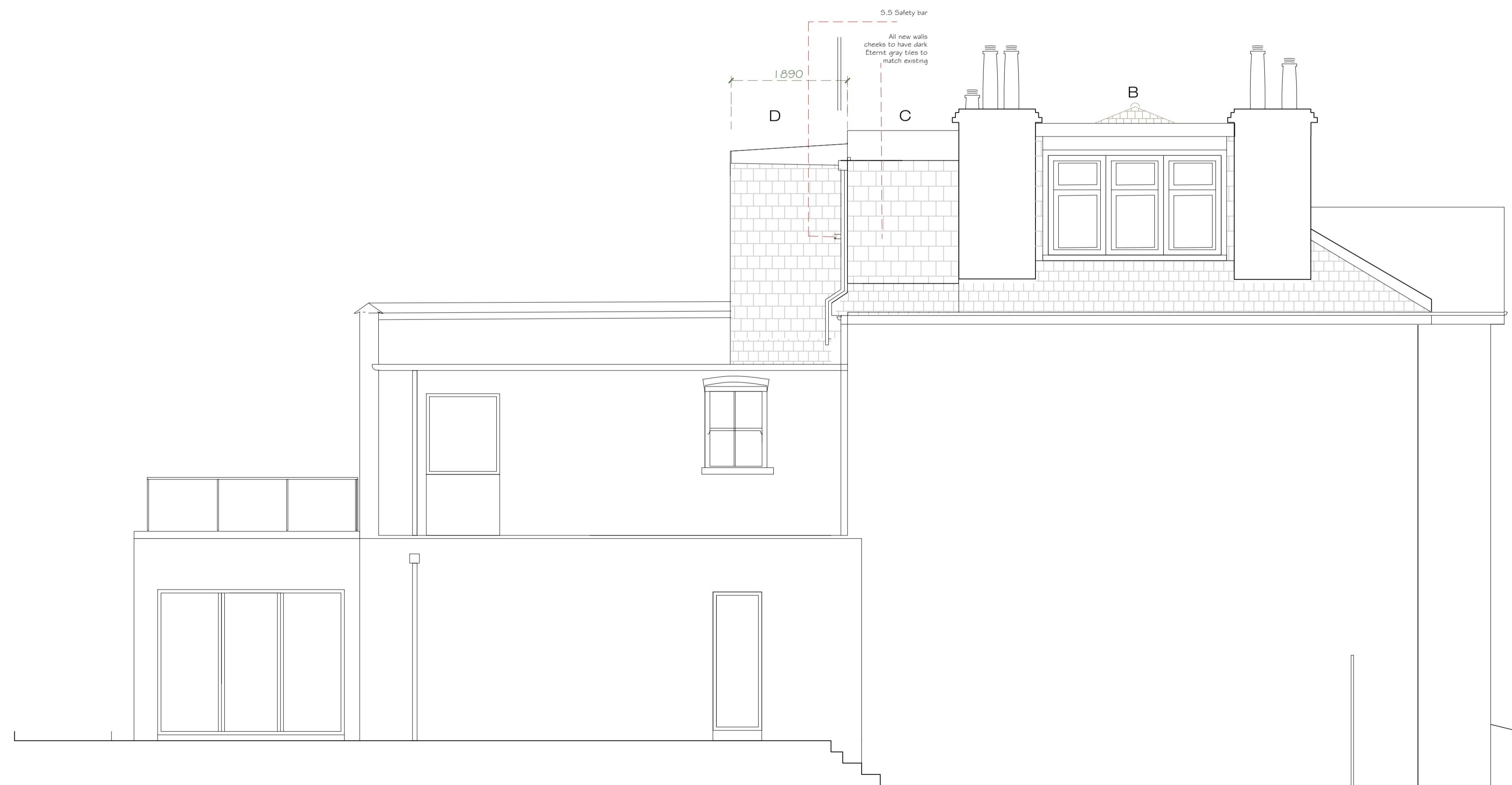
PROPOSED SIDE ELEVATION PROPOSED SIDE PATH ELEVATION