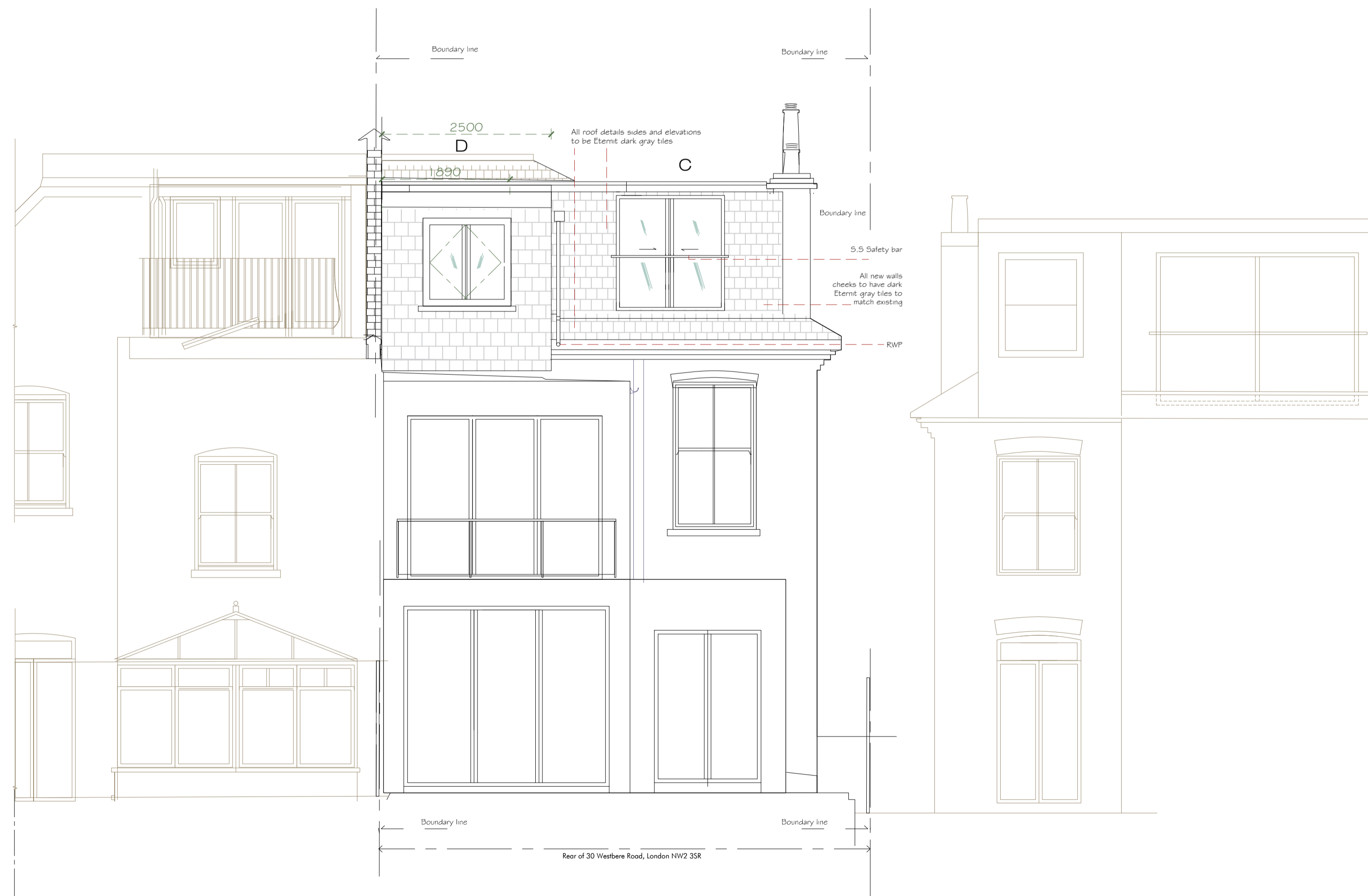
PROPOSED GARDEN VIEW PROPOSED REAR ELEVATION