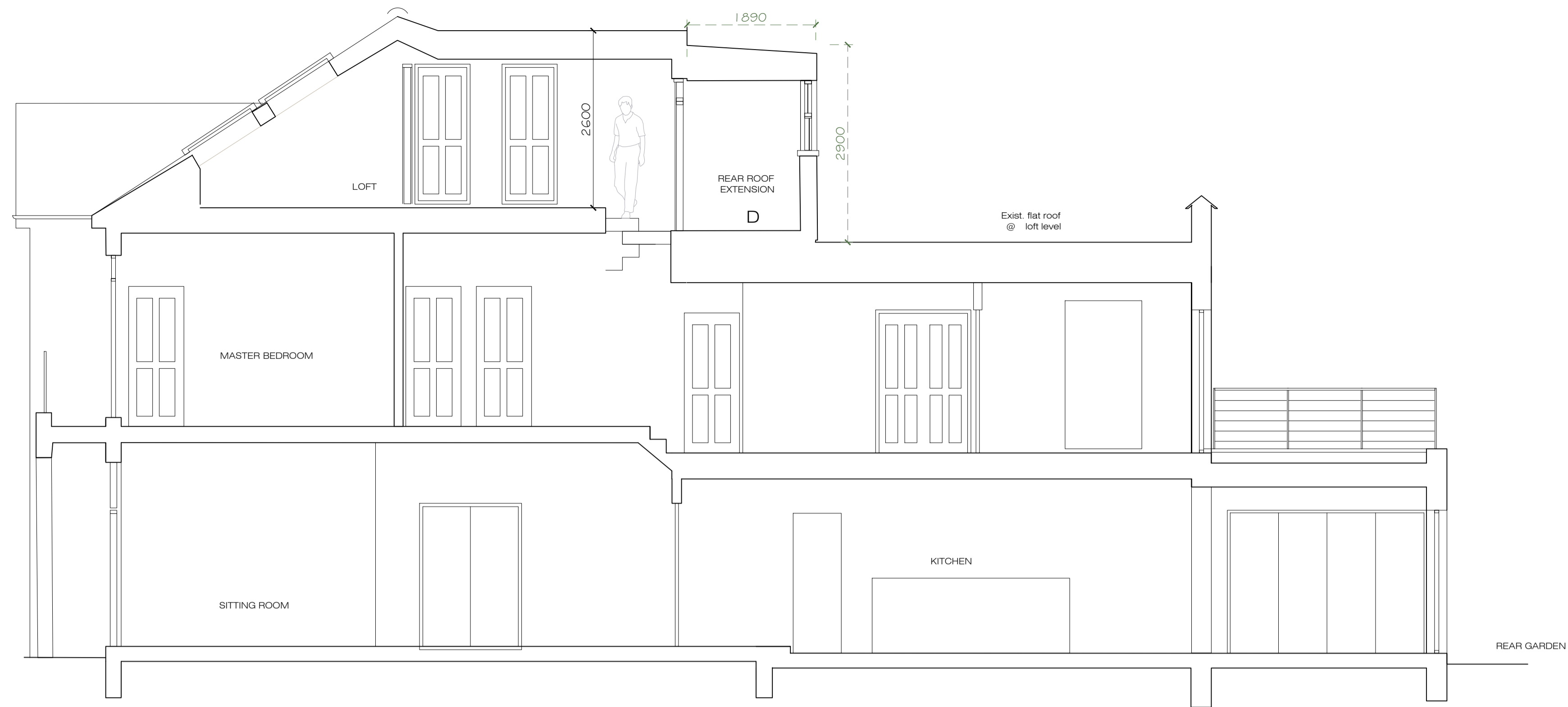
PROPOSED LONG SECTION PROPOSED SECTION A - A

This drawing is to be read in conjunction with the structural engineers' drawings, all other layout and detail drawings together with the Schedule of Works and Specification.