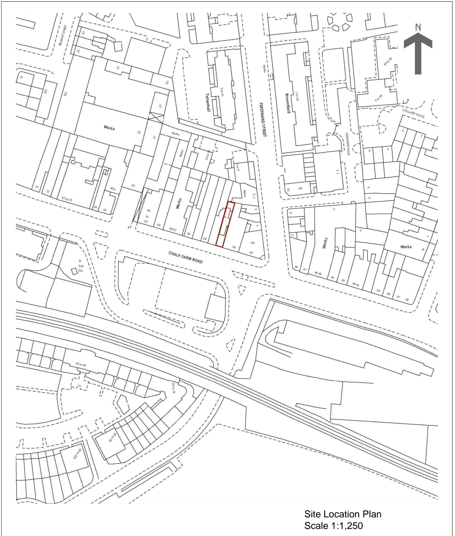
Site Location Plan Scale 1:1,250