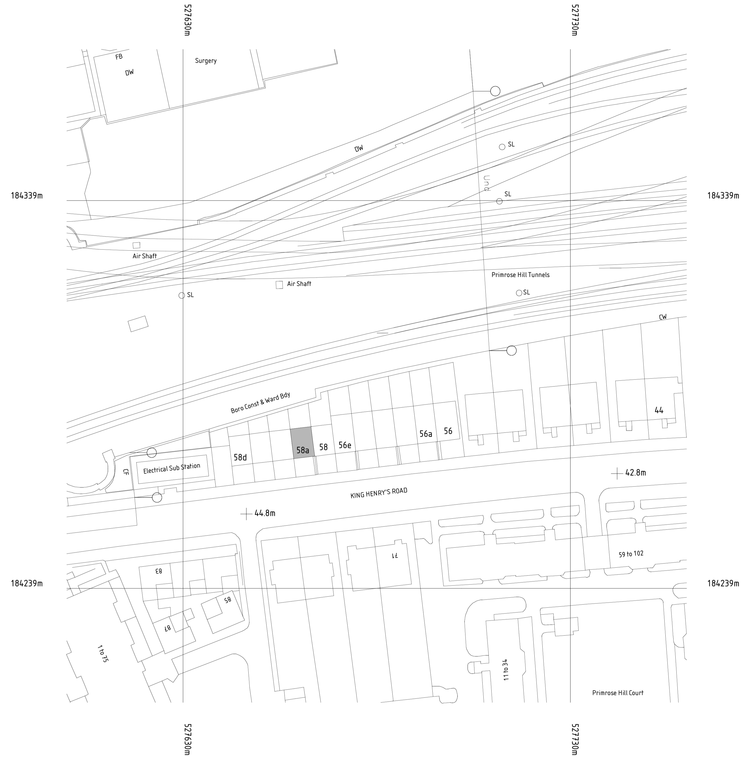
SITE PLAN 1:500 @ A1 / 1000 @ A3

DO NOT SCALE THIS DRAWING CONTRACTOR TO CHECK ALL DIMENSIONS ON SITE PRIOR TO CONSTRUCTION ANY DISCREPANCIES TO BE IMMEDIATELY REPORTED TO THE CONTRACT ADMINISTRATOR PRIOR TO CONSTRUCTION NO UNILATERAL ACTION TO BE TAKEN BY CONTRACTOR COPYRIGHT © 2017 we not i ALL RIGHTS RESERVED