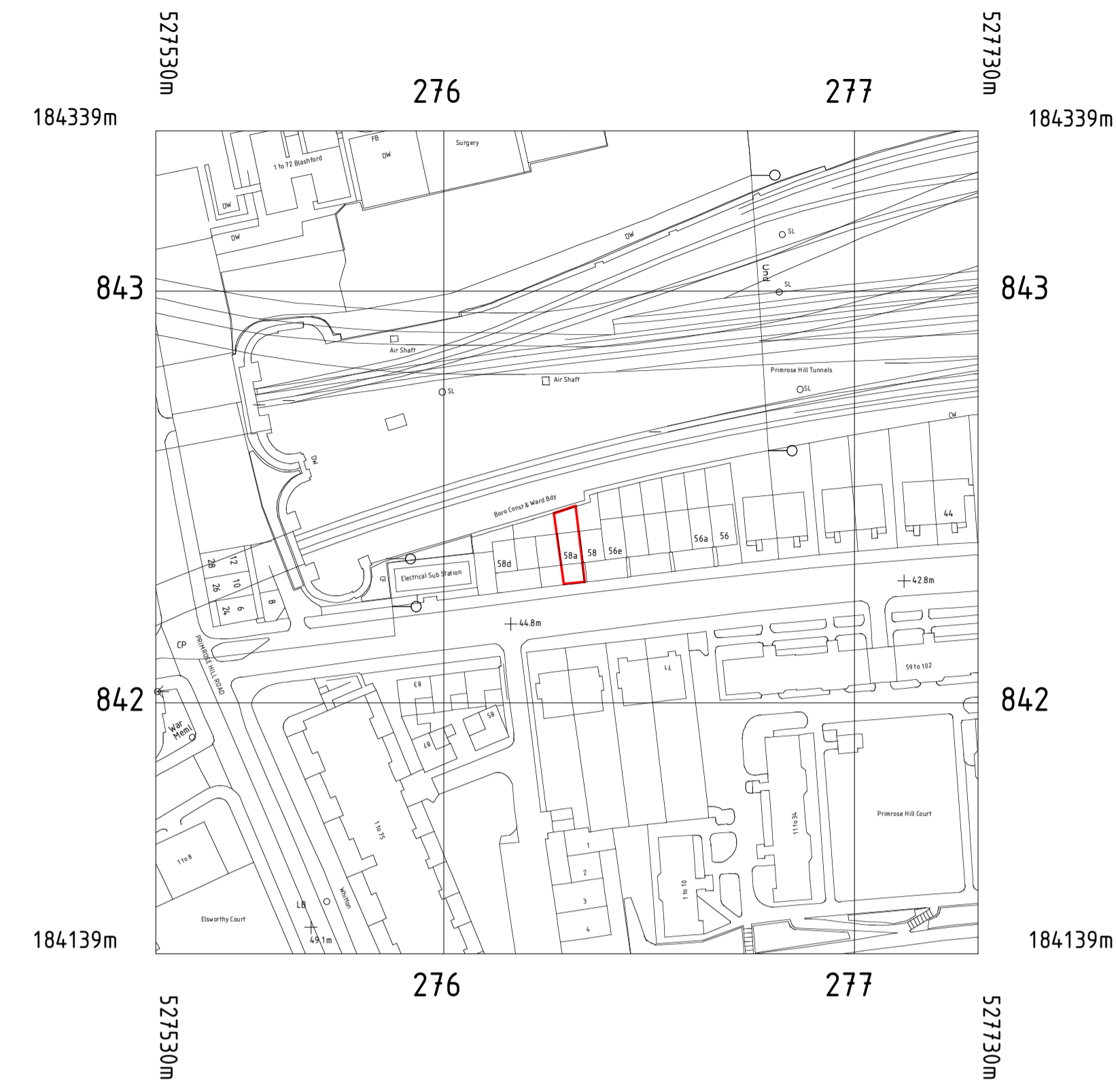
LOCATION PLAN 1:1250 @ A1 / 2500 @ A3