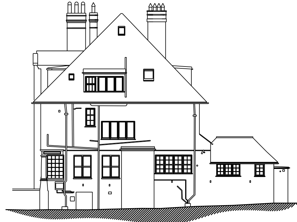
Existing elevation on A - A