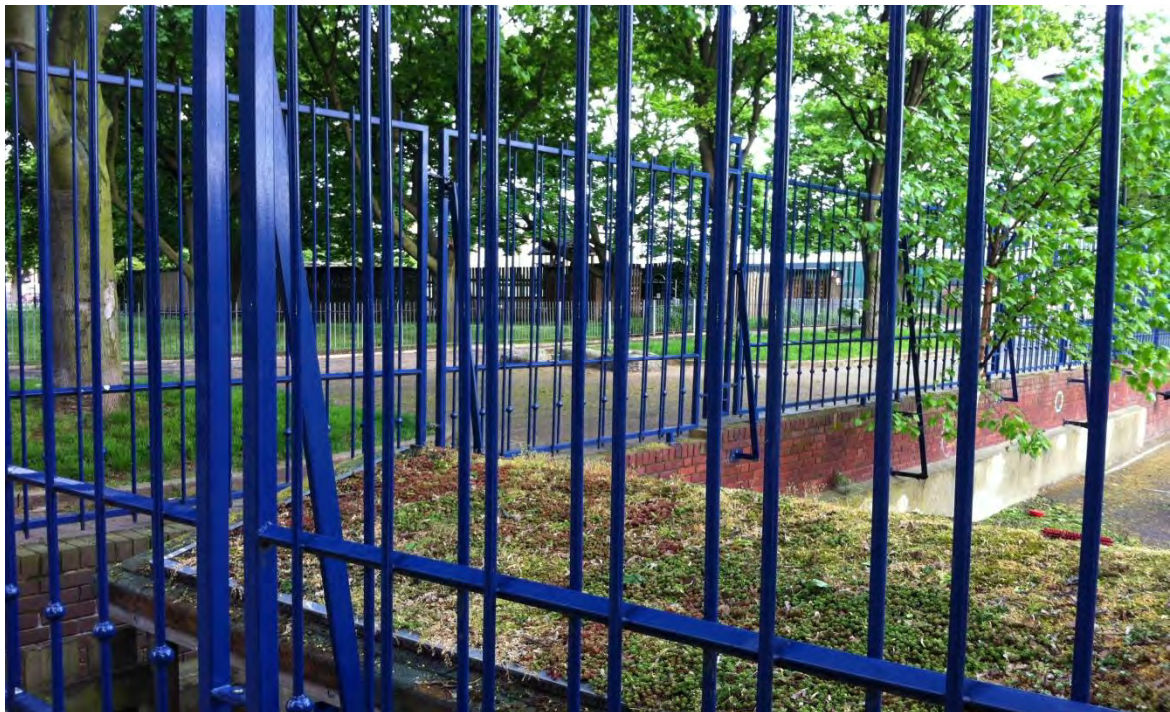
Figure 2: View looking north across Edith Neville Primary School (northern parcel of land) from Polygon Road