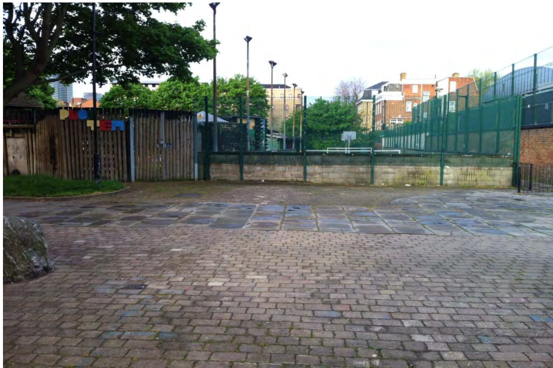
Figure 4: View looking west along the northern boundary of the northern parcel of land.