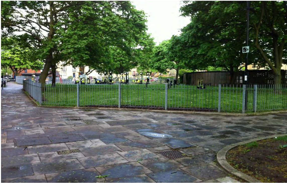
Figure 3: View looking northwest across the northern parcel of land from the junction of Polygon Road and Ossulston Street.