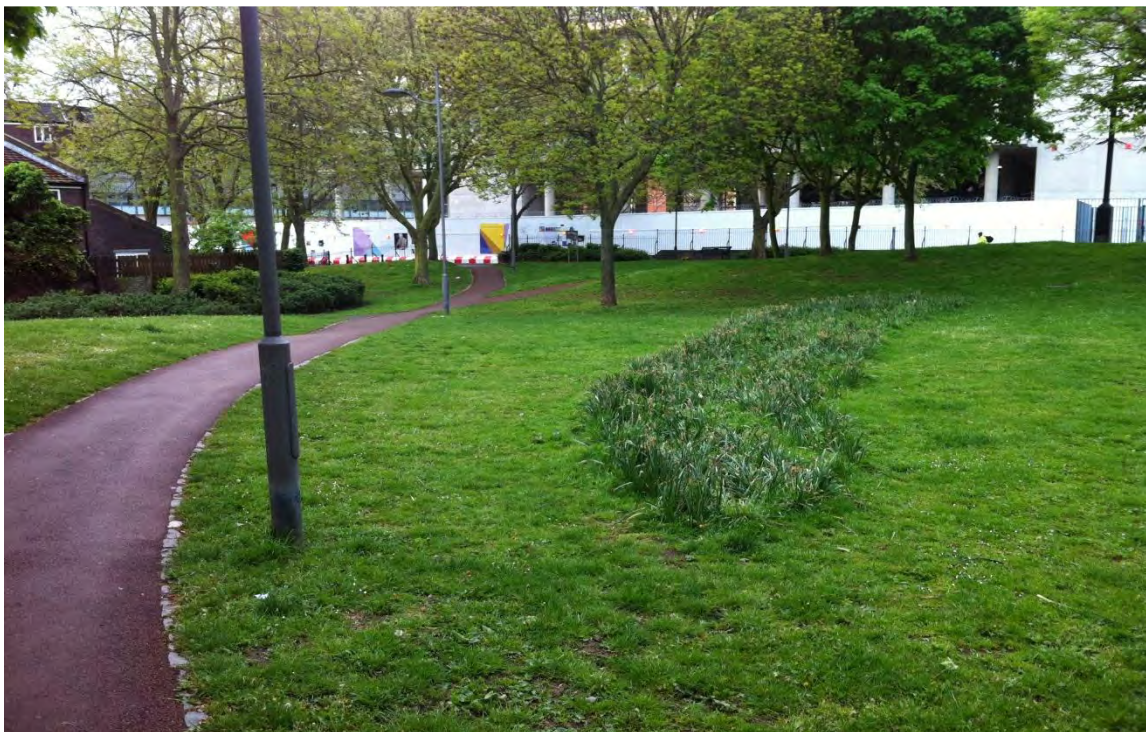
Figure 6: View looking south across the eastern parcel of land towards Brill Place.