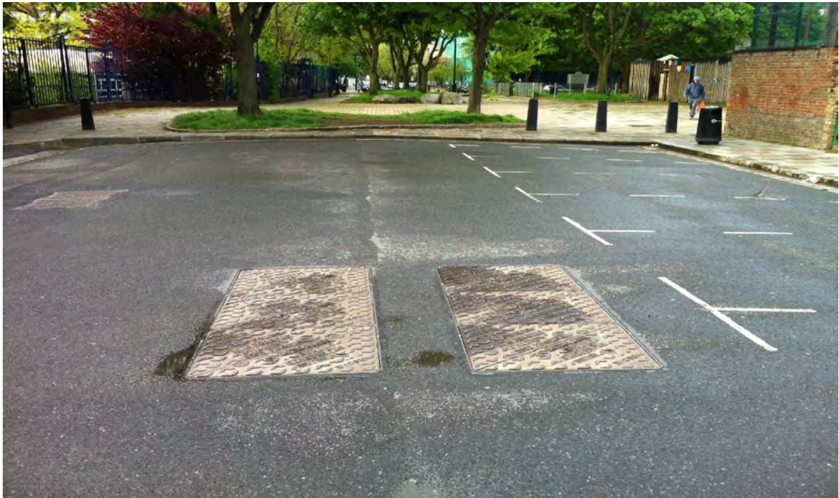
Figure 7: View across looking south along the line of Regents Canal from the northern boundary of the northern parcel of land.