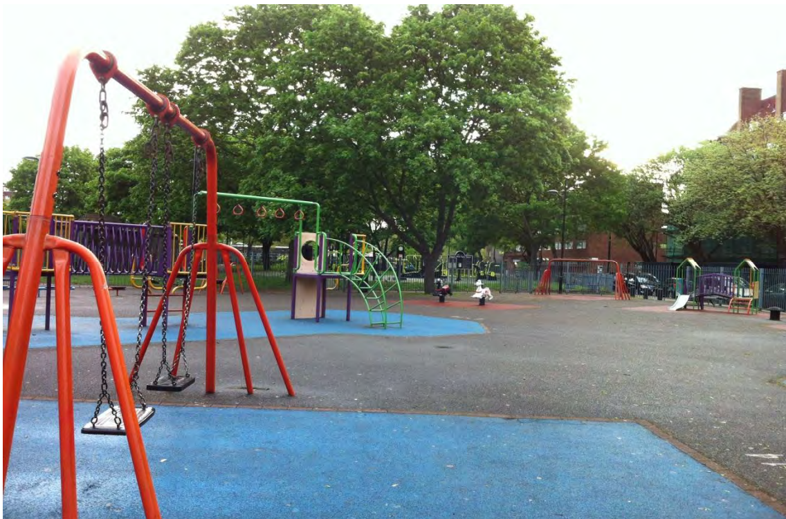
Figure 5: View looking east across the northern parcel of land from the southwestern corner.