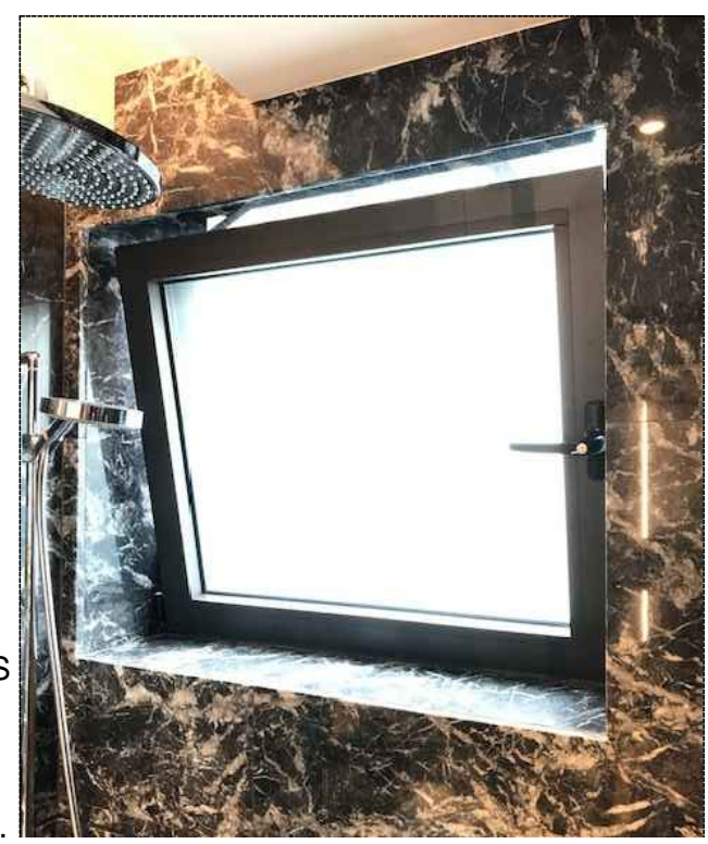
BOTTOM HUNG FROSTED GLASS WINDOW TO FIRST FLOOR BATHROOM. OPEN POSITION.