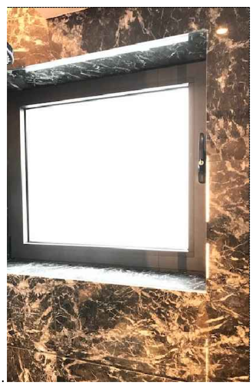
BOTTOM HUNG FROSTED GLASS WINDOW TO FIRST FLOOR BATHROOM. CLOSE POSITION.