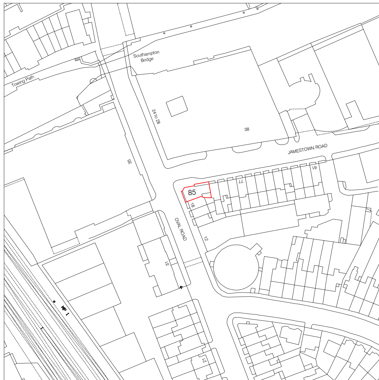
01 EXISTING LOCATION PLAN scale 1:1250