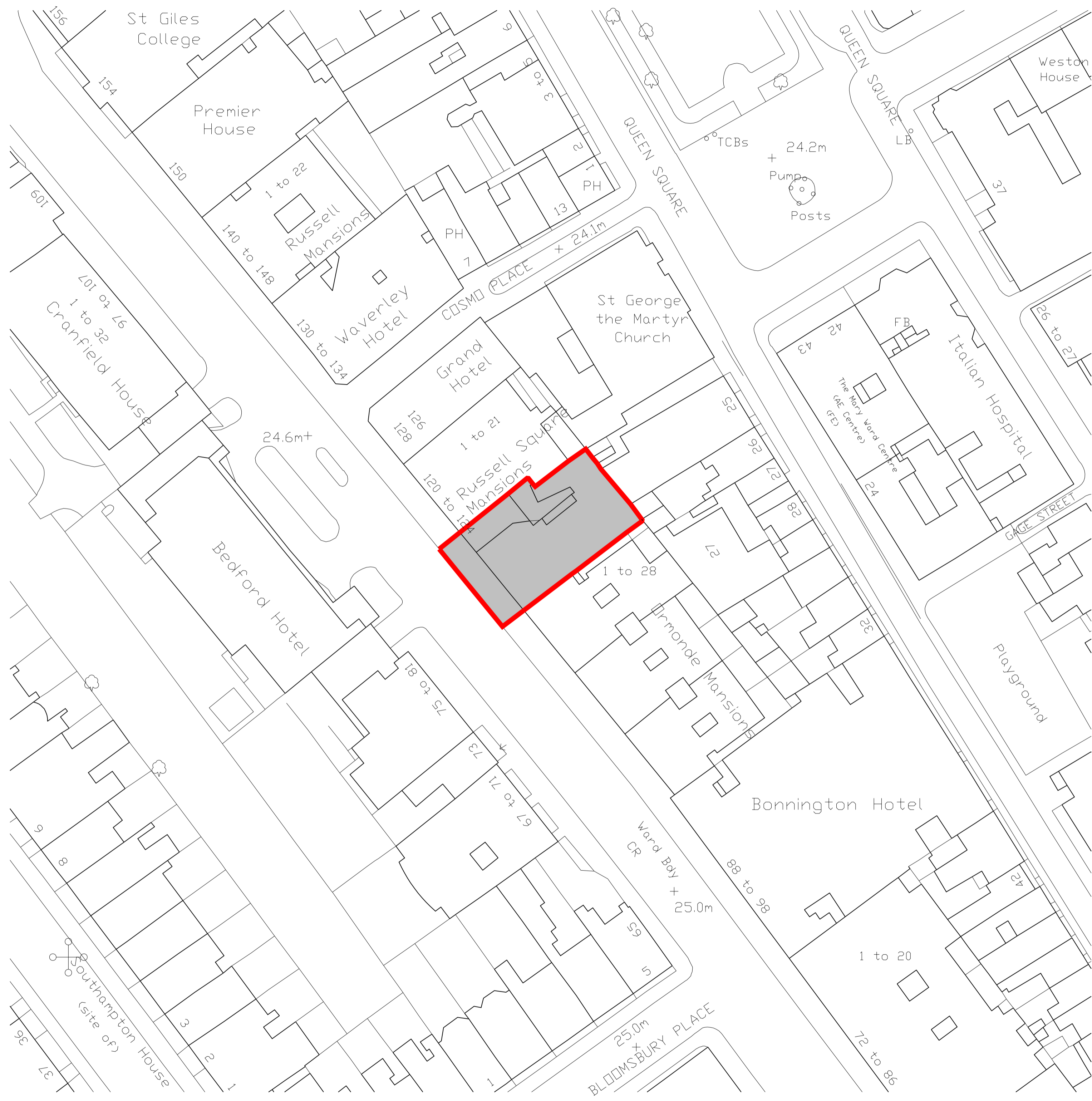
1 Site location PLAN - 1:500