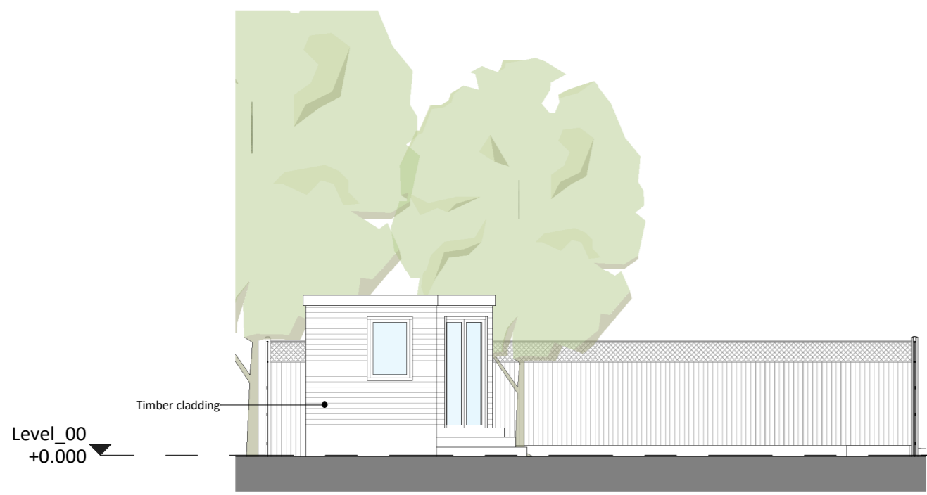
1 Existing Front Elevation 1 : 100