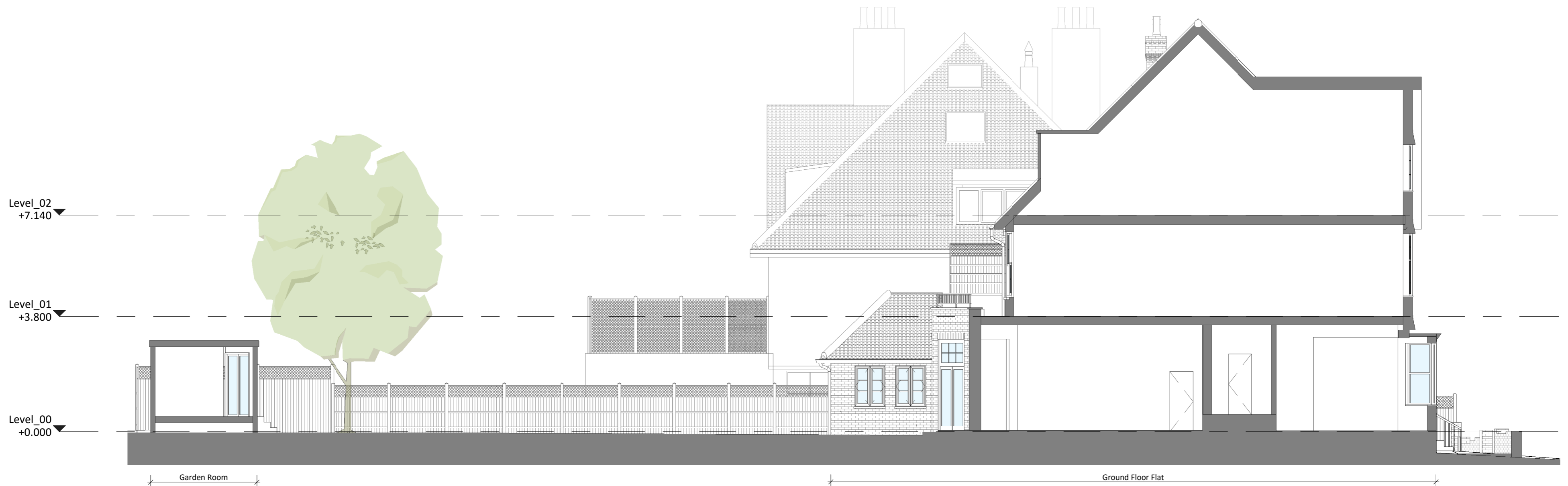
3 Existing Section AA 1 : 100