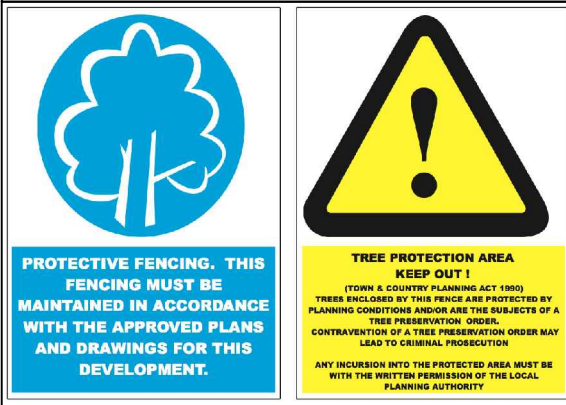
Tree Protection Signage – Example