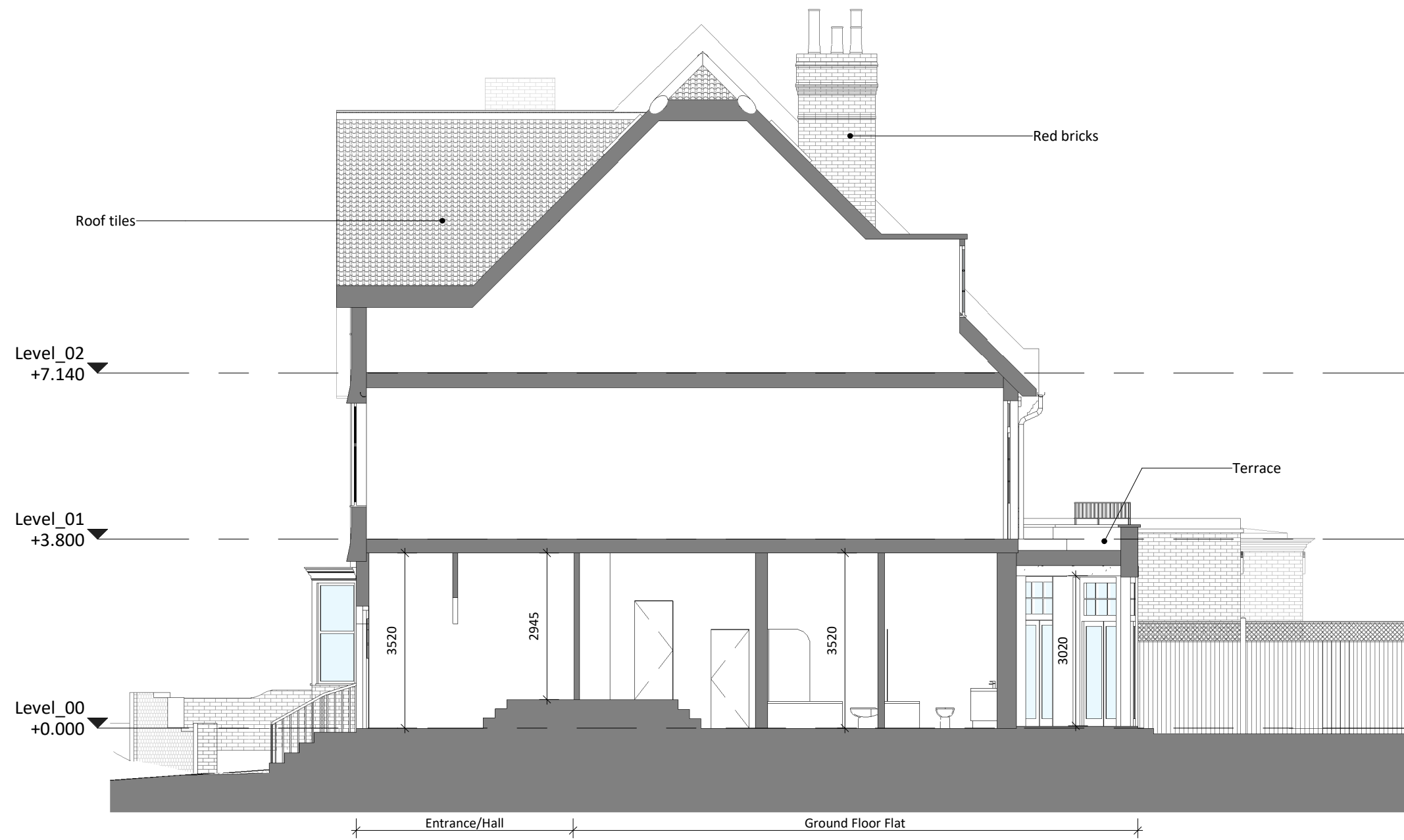
1 Existing Section AA 1 : 100