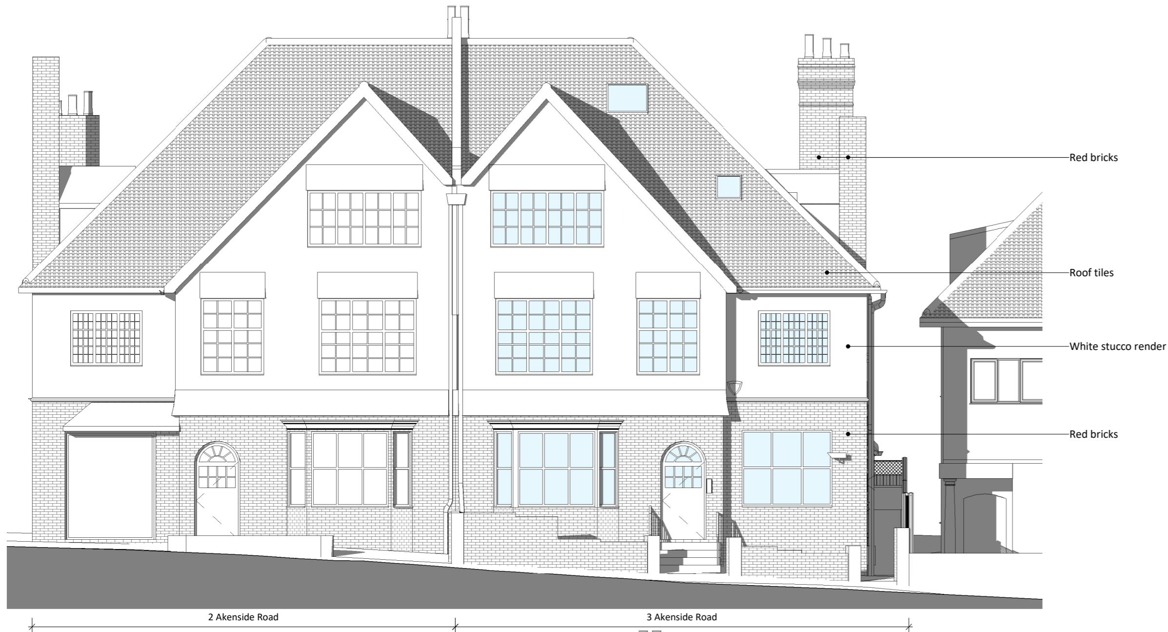
1 Existing Front Elevation 1 : 100