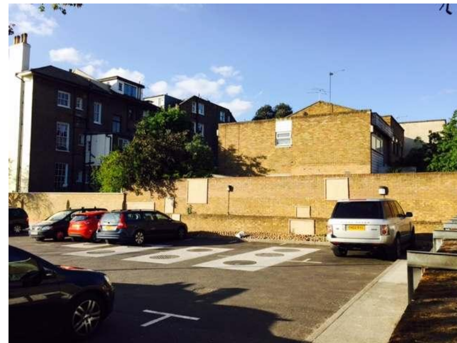
View ofsite from Tesco car park