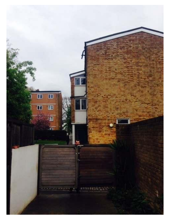
View from site to 36 Abingdon Close opposite

View to Abingdon Close from Tesco car park