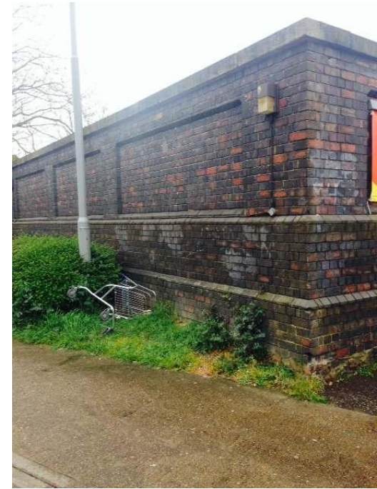
View of adjacent brick wall to railway ventilation shaft

View to Abingdon Close from Tesco car park