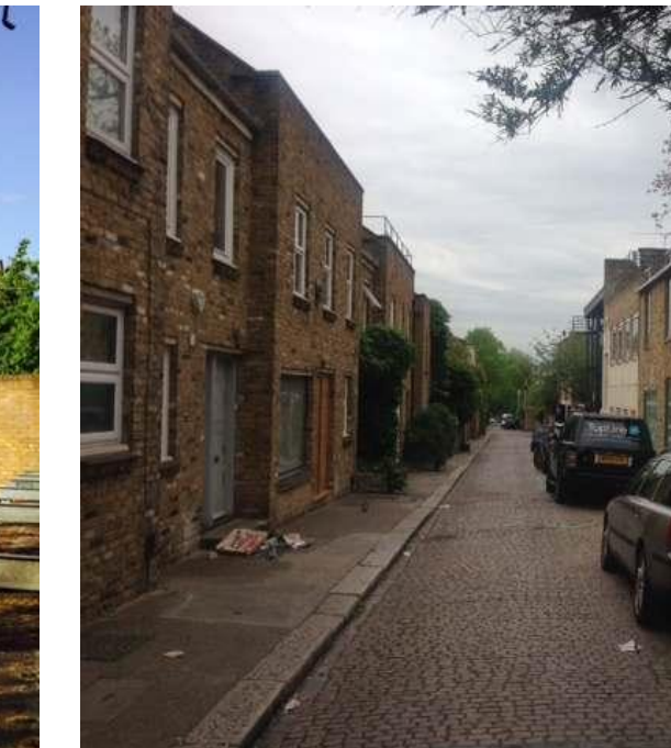
View down Camden Mews