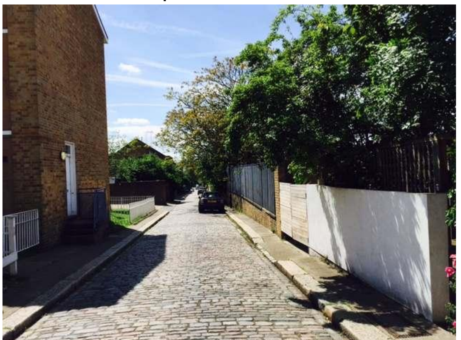
View down Camden Mews showing Abingdon Close flats opposite no 57 Camden Mews