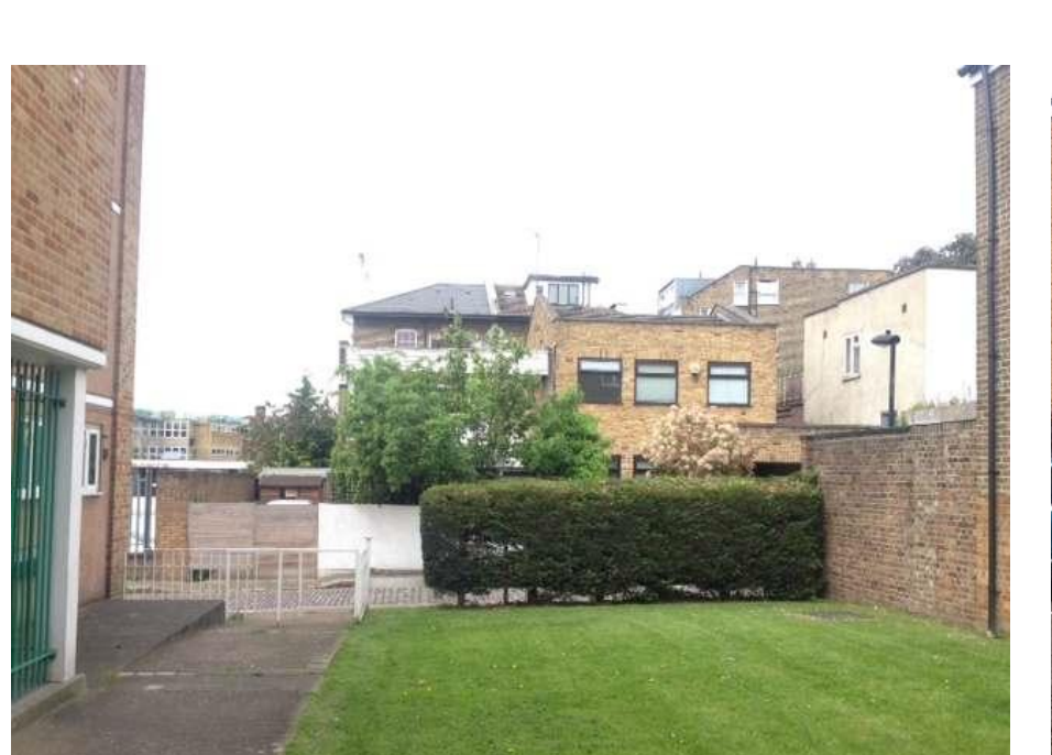
View from Abingdon Close

All dimensions are to be checked on site prior to construction. Any discrepancies are to be reported to the architect before works commence. All dimensions are in millimeters. Do not scale dimension. This drawing is to be read in conjuction with the specification and with all relevant consultants/specialists' drawings and/or documents.