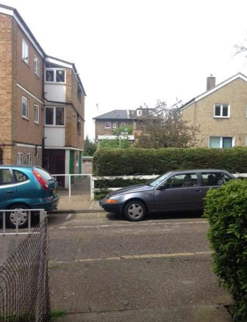
View from Camden Square