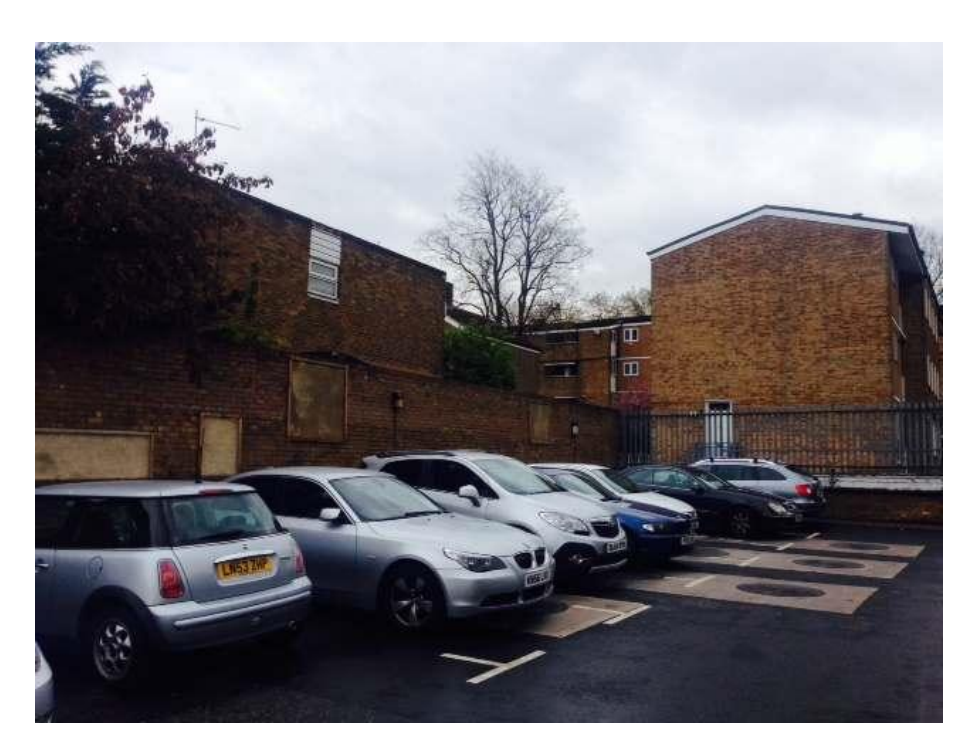
View to site from Tesco car park