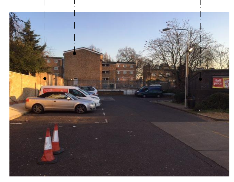
VIEW TOWARDS CAMDEN MEWS FROM CAMDEN ROAD CAR PARK ENTRANCE TO TESCO / PETROL STATION

BLACK BRICKWORK TO RAILWAYTUNNEL FACING 57 CAMDEN MEWS ACROSS CARPARK