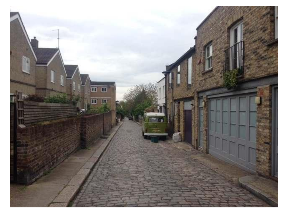
View from Camden Mews