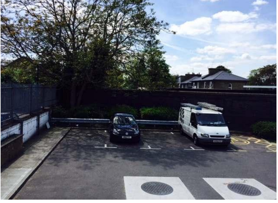
CAMDEN MEWS 57 & 59 CAMDEN MEWS