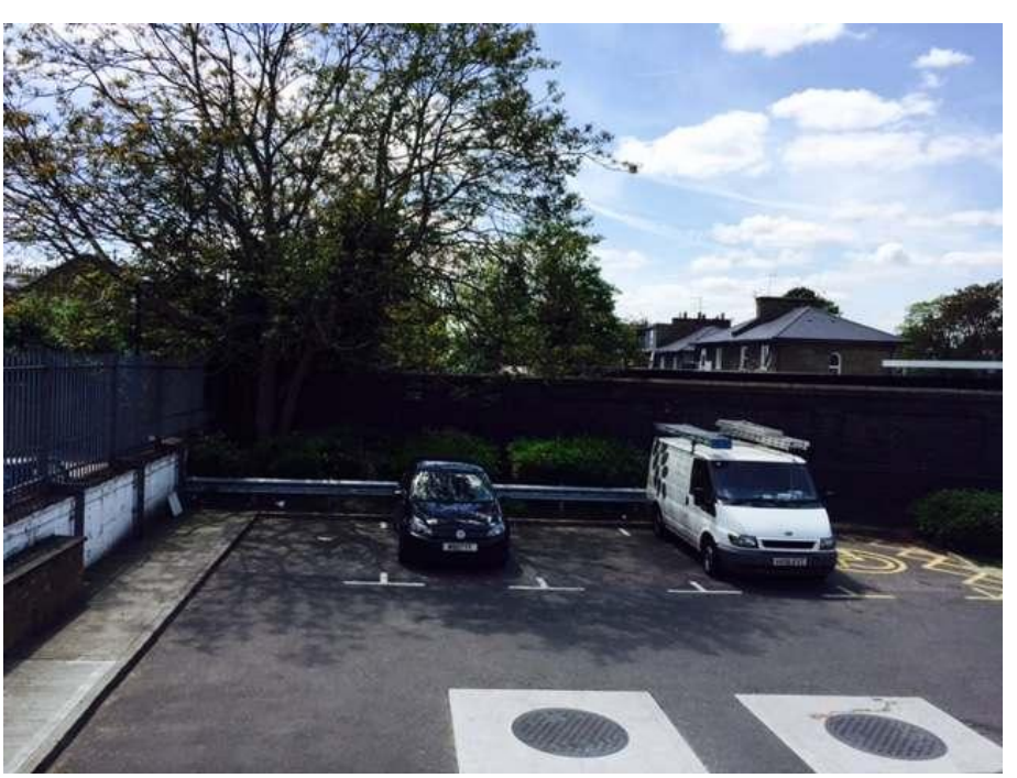
VIEW FROM SITE ACROSS ADJOINING CAR PAR TO RAILWAYTUNNEL IN BLACK BRICKWORK