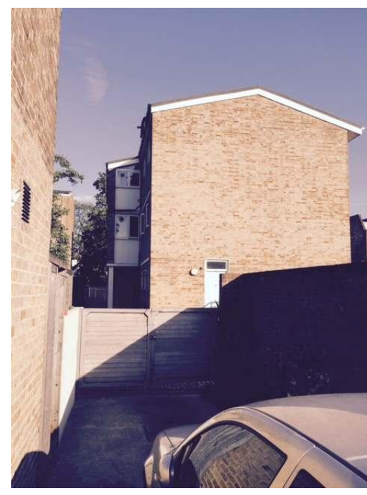
View from 57 Camden Mews to Abingdon Close flats opposite