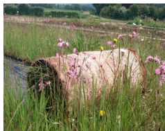
Species mix x 20