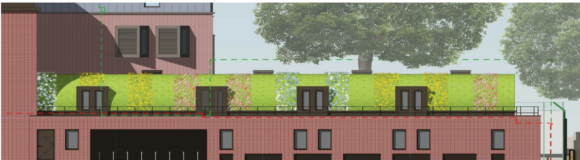
Group 1- Green Mix Wild Turf Mix

4 Planting Groups – group 1 below (Wild flower meadow turf) to continue onto green roof for seamless transition from living wall to green roof. Majority of species have high BREEAM rating Green roof itself to contain varying sedum and turf bands to keep the distinctive bands.