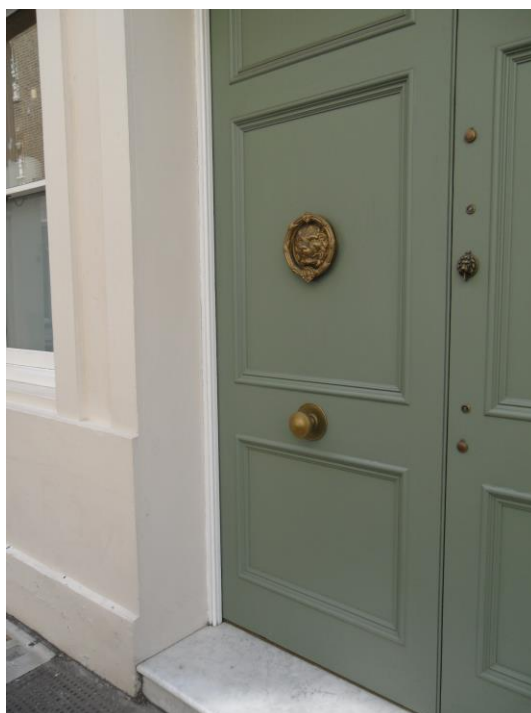
The Proposed paint colour will be similar to the colours recently applied to No. 1 Coptic Street at the corner of Gt Russell Street This colour works effectively with the restored brass work on the door of No 90.