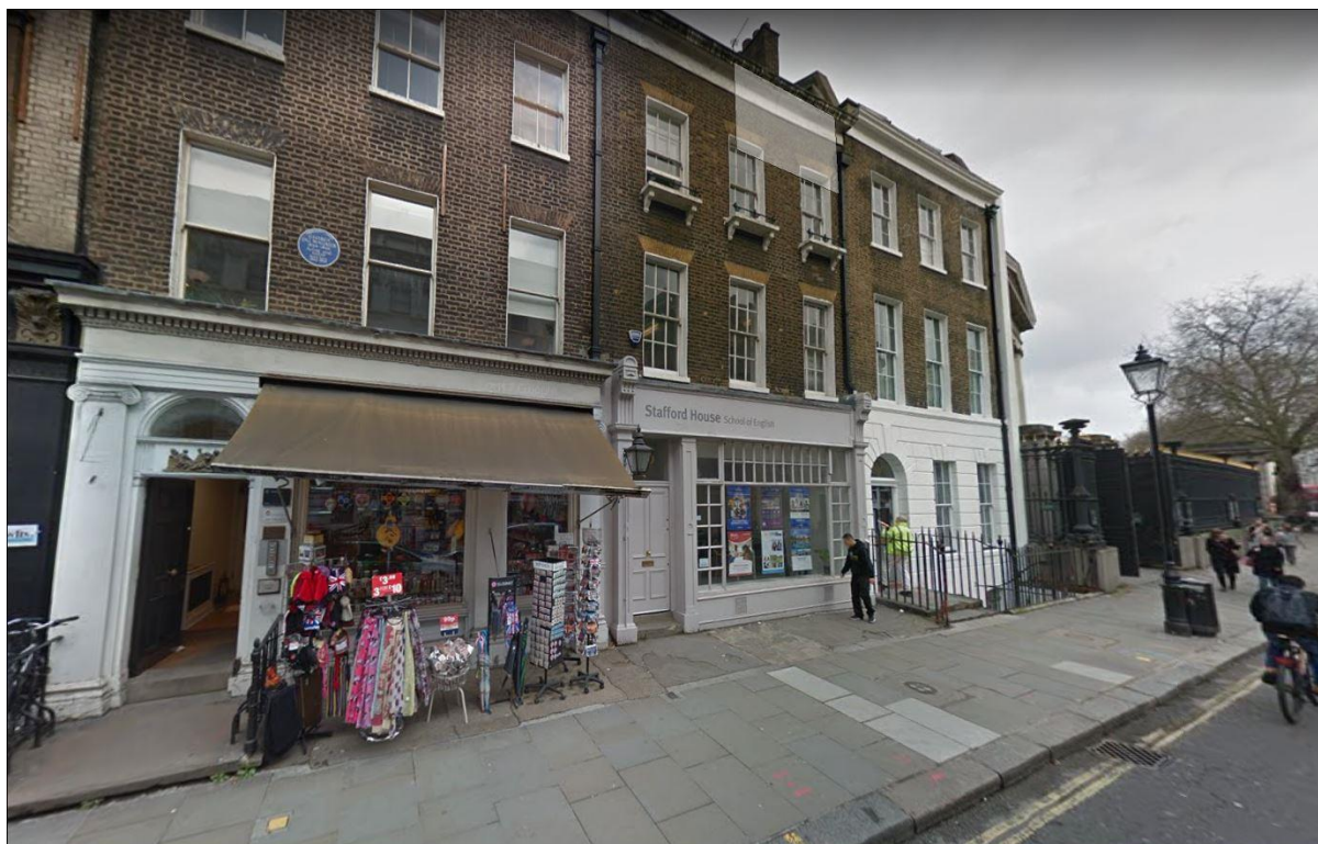
The 89, 90 and 91 Great Russell Street Ensemble

Our proposed treatment of the signage and redecoration of the shop front outlined following has been formulated with regard to the historic nature of all three buildings in this urban ensemble.