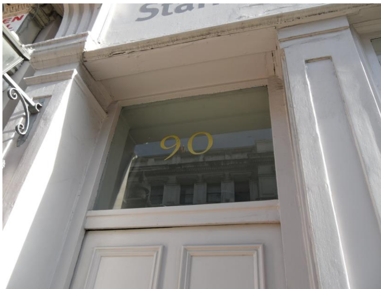
Existing door head and Glass Transom Light with gilt address number Note: the existing door is not original (- see notes above)