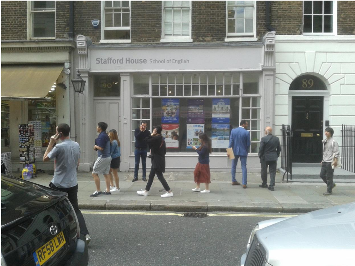
View of existing 90 Great Russell Street Shop Front