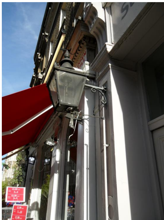
The Existing Ornate Sugg Gas Lamp, bracket and control paraphernalia will be cleaned and restored (though not re-activated)