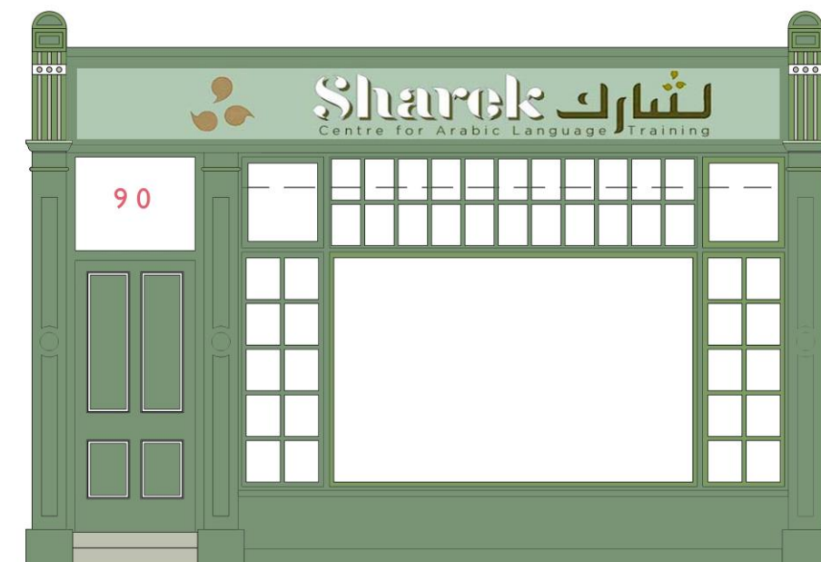
Proposed Advertising Layout on Existing Sign Fascia Board