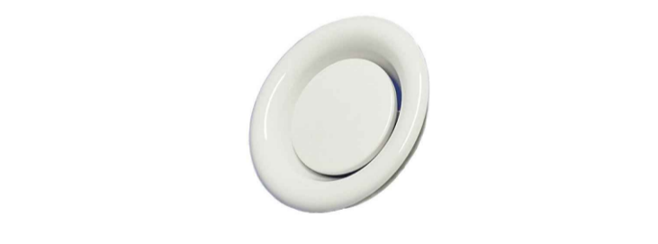
Typical Extract Air Valve / Grille

Architects layouts do not tie up with Bowler James document: BJB 160518_Skeel_Concept Design Package