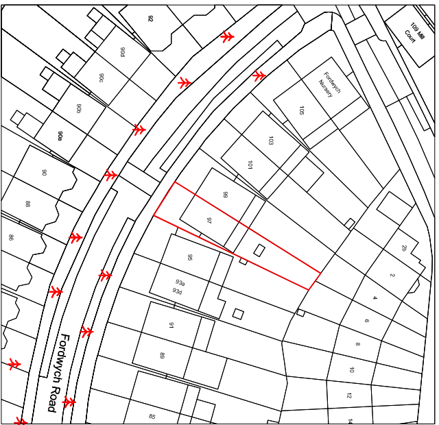
SITE PLAN 1:1250