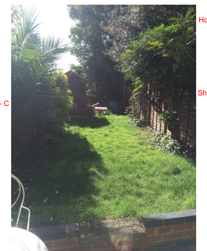
Shrub - C