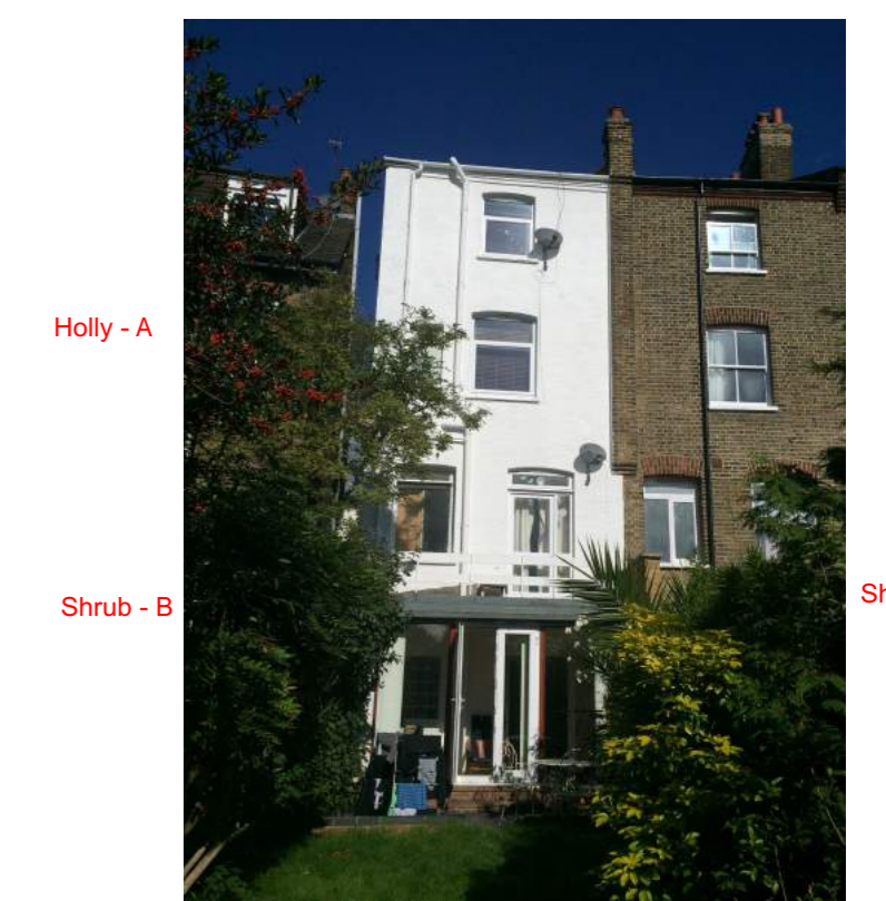
Holly - A