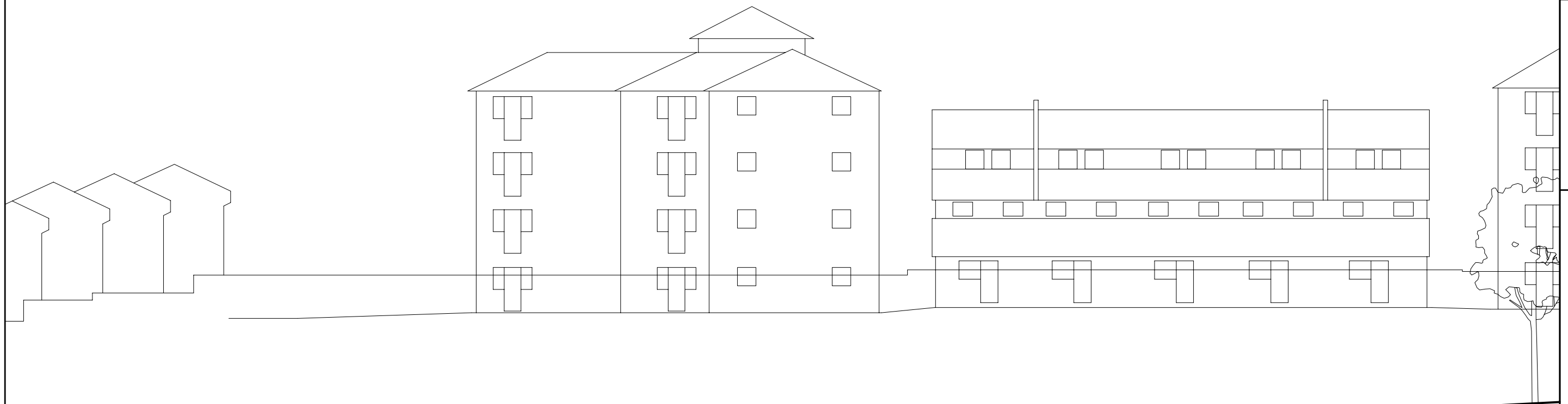
01_Existing Elevation 01

DO NOT SCALE OFF THIS DRAWING ALL DIMENSIONS MUST BE CHECKED ON SITE BEFORE THE ARCHITECT OF WORK DISCREPANCIES PRIOR TO CONSTRUCTION PLOT SIZE: A3