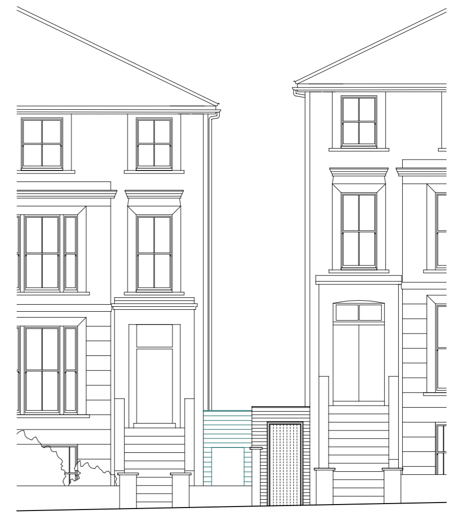
No. 71 No. 73 2. STREET ELEVATION