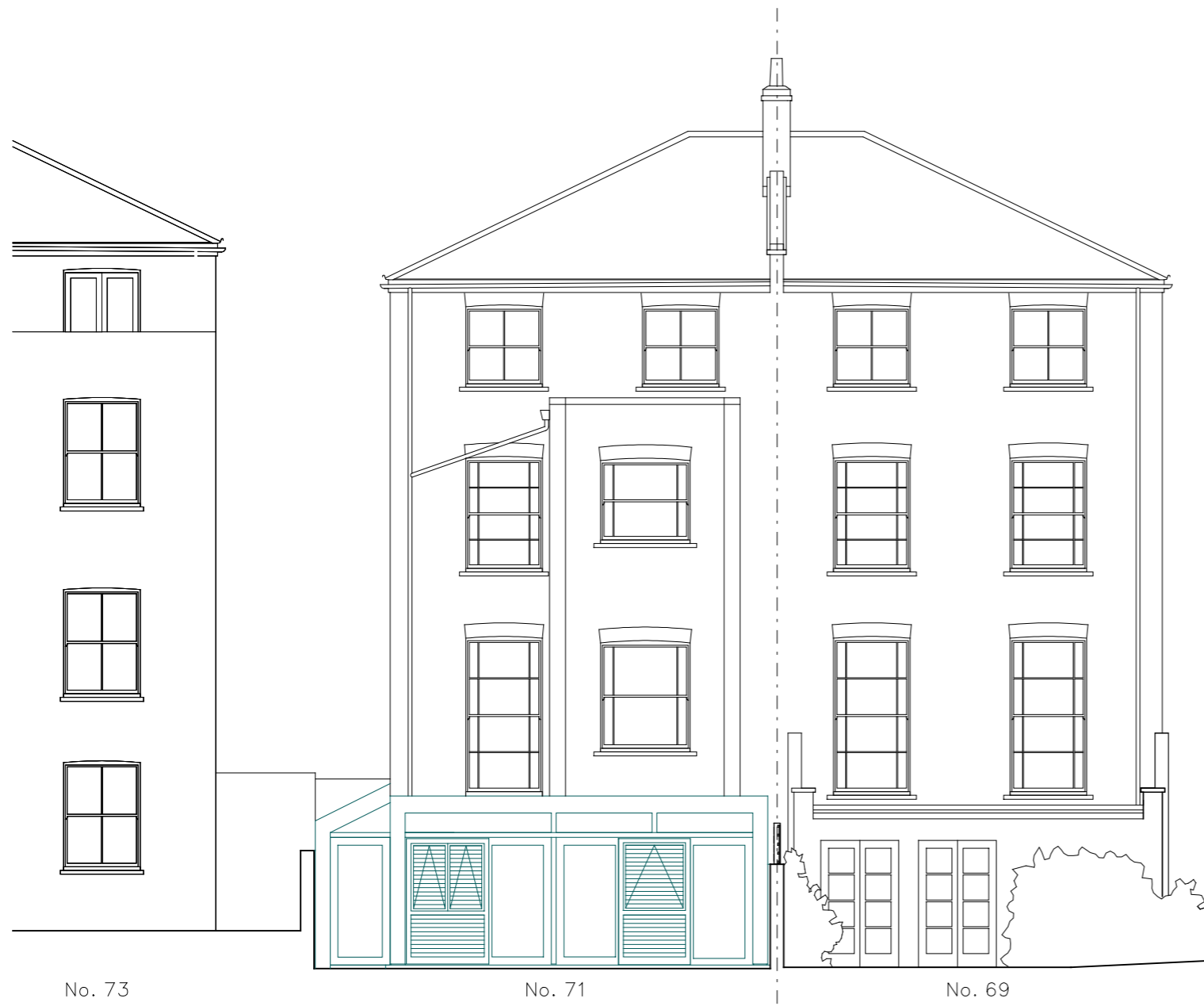
No. 73 No. 71 No. 69 1. GARDEN ELEVATION