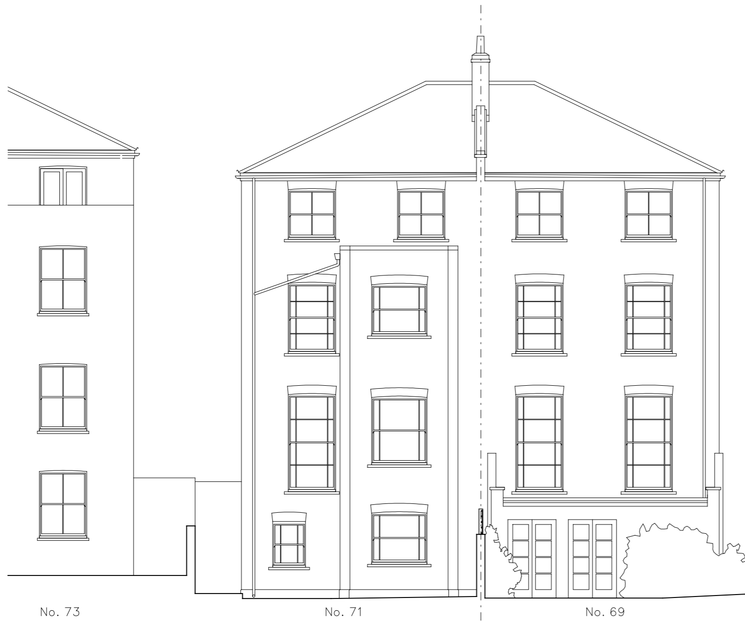
No. 73 No. 71 No. 69 1. GARDEN ELEVATION