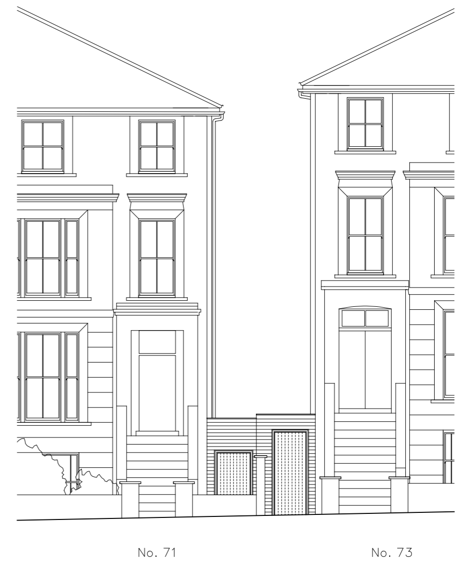
No. 71 No. 73 2. STREET ELEVATION