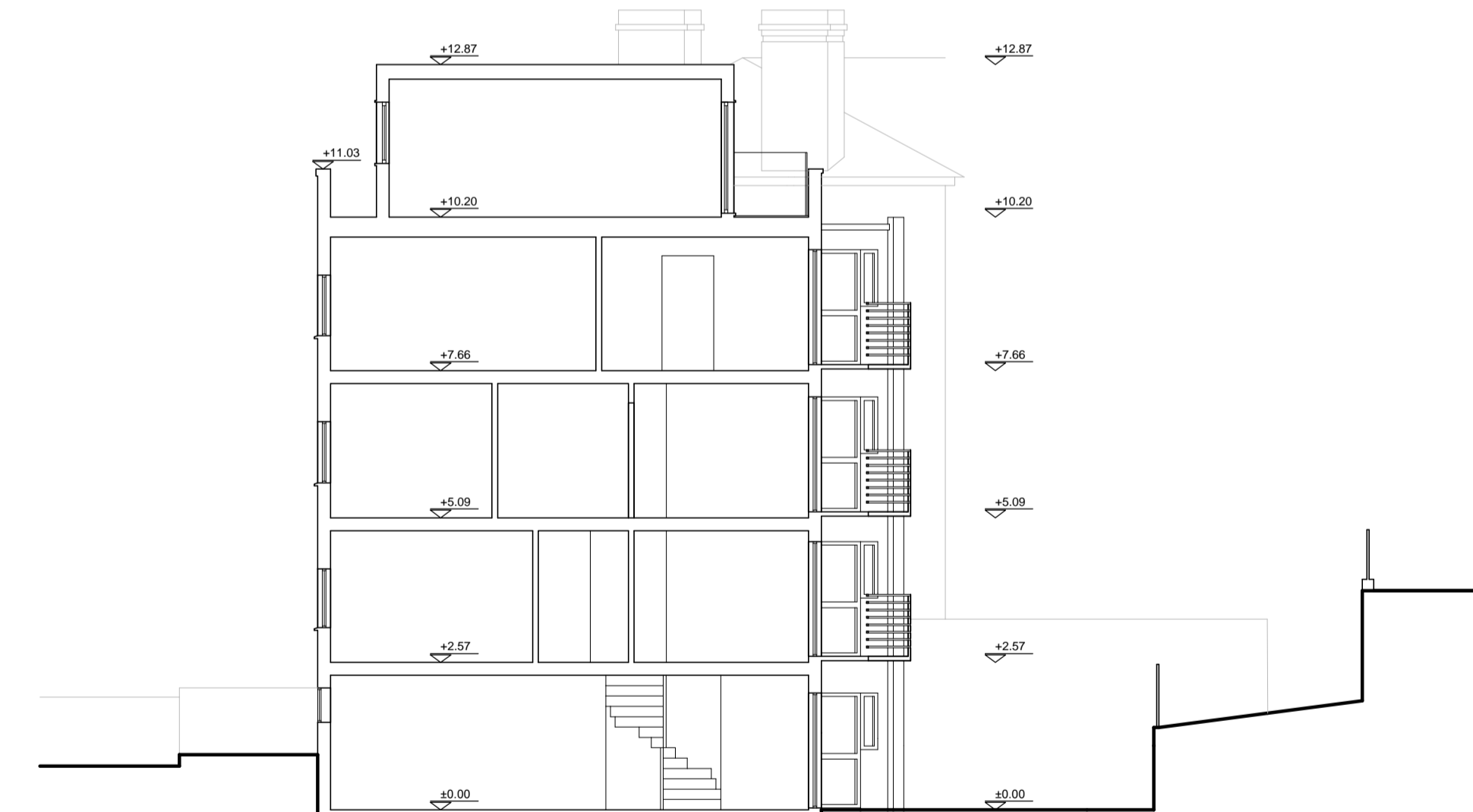
Proposed Section Scale 1:100