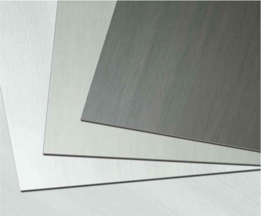
Pre-PATINA blue-grey (middle shade)