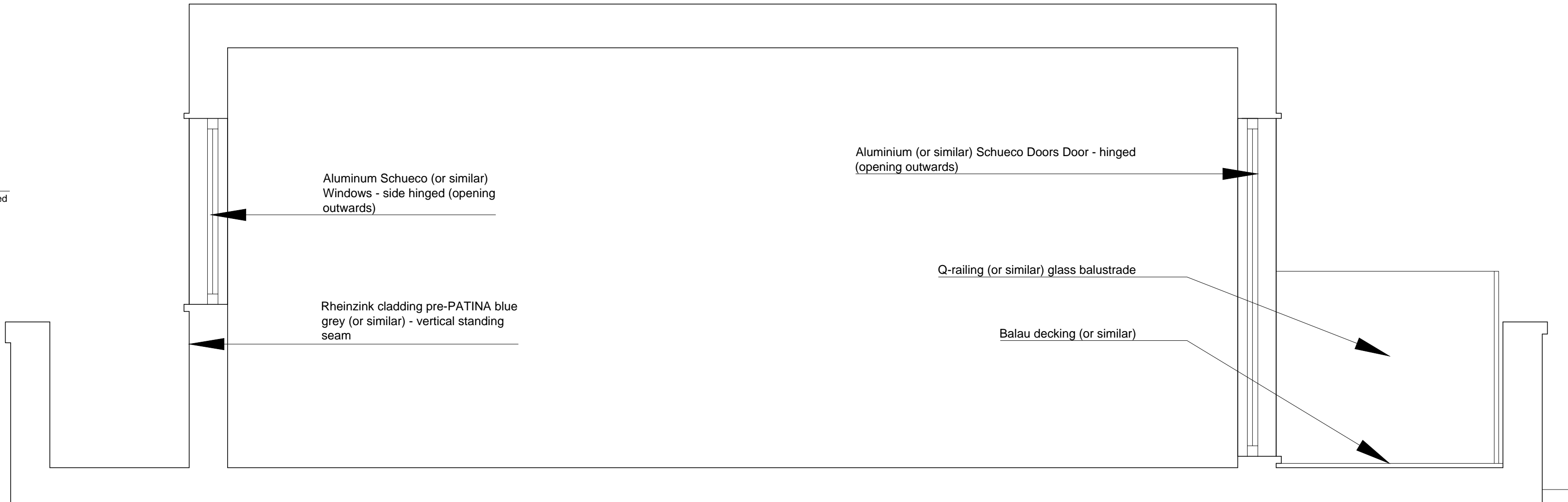
Section of the new floor - Facing materials Scale 1:20