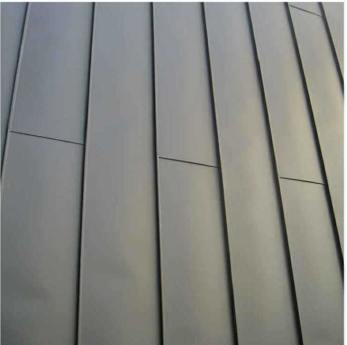
Zink cladding - standing seam