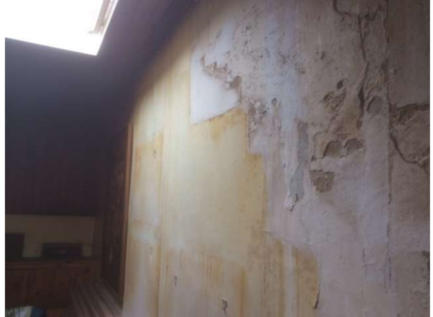
21 Interior No 38