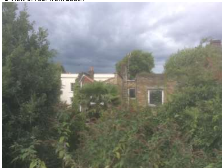
6 View of rear from South