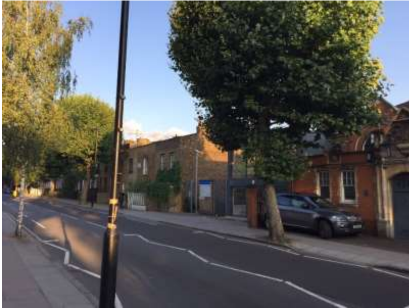
1 Long view looking East