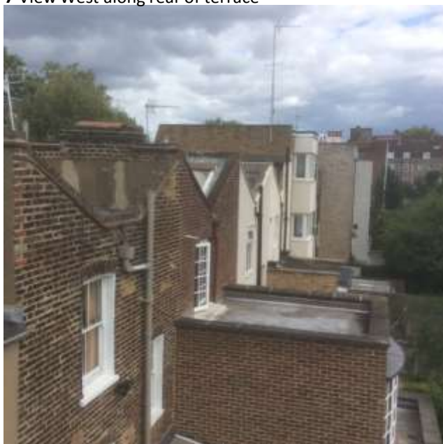
7 View West along rear of terrace