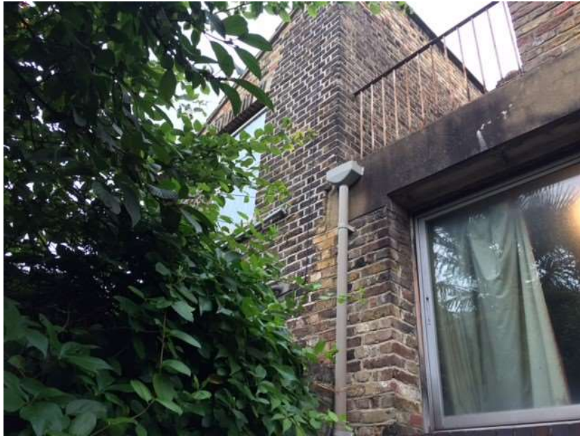
9 View 36