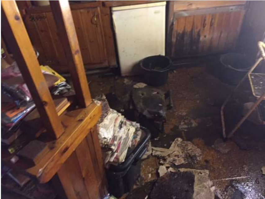
20 Interior No 38