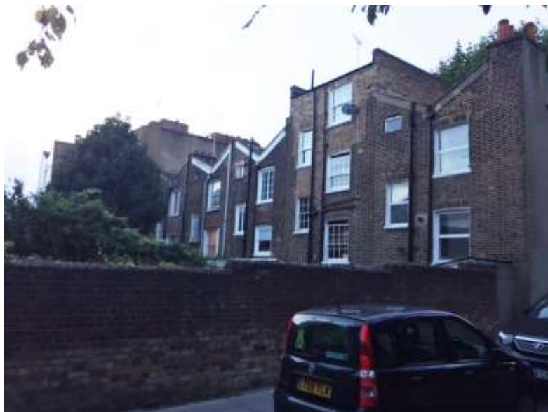
5 Rear of terrace looking West