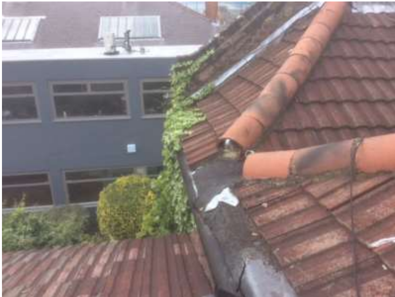
14 Roof of number 36