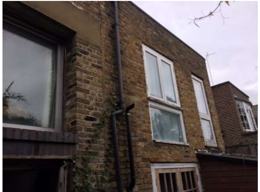
10 View of rear of No 40