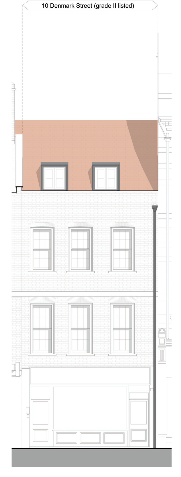
Front elevation with tiled roof shown