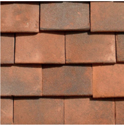
Clayhall Medium by Heritage Clay Tiles