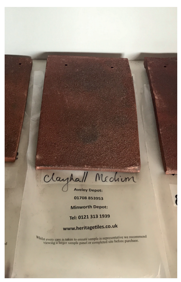
Proposed peg tile to pitched roof faces -Clayhall Medium by Heritage Clay Tiles Sample on site at 4 Denmark Street, WC2H