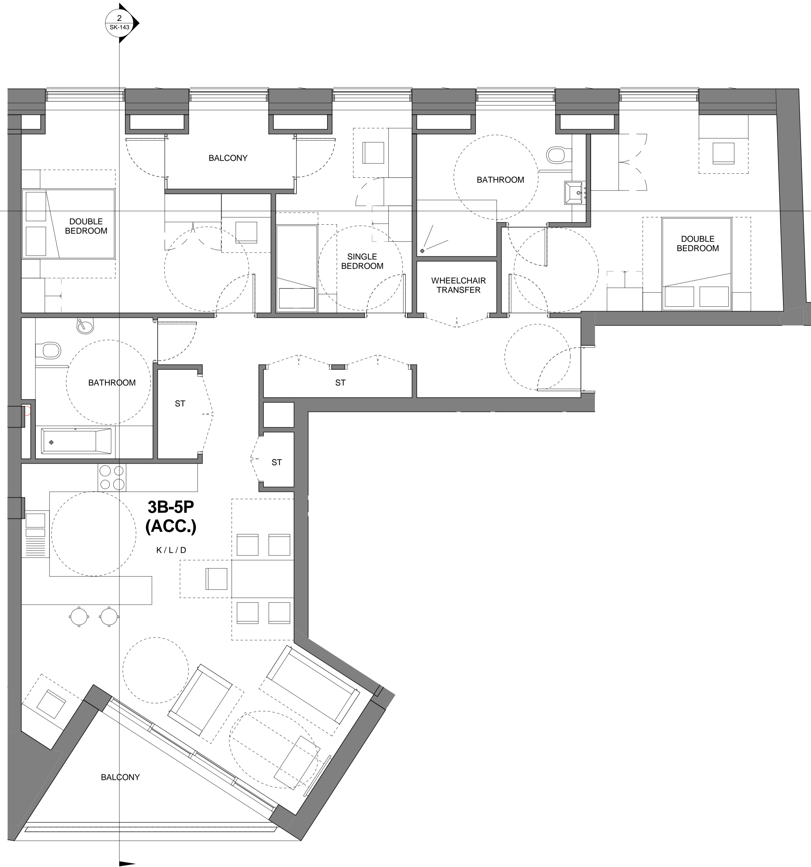
1 3B5P (ACC.) MARKET UNIT SCALE 1 : 50